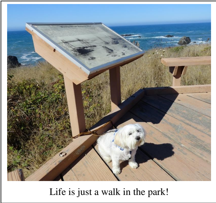
Life is just a walk in the park!