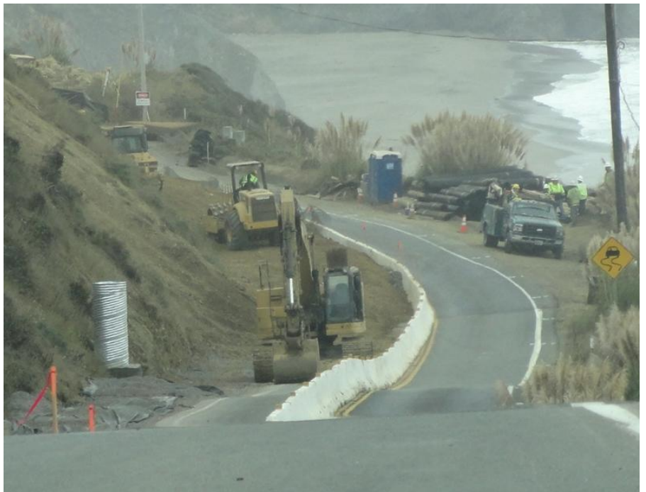
There's a whole lot of diggin' going on at the Westport Slide!

On Tuesday, October 4 th at 7:00PM , at their monthly meeting at the Westport Church, the Westport Municipal Advisory Council will consider the Draft Cannabis Ordinance proposed by the County. This is your opportunity to offer local input on that measure. A copy of the draft ordinance is available at the WMAC website on the "Next Meeting" page. Check it out with this link: http://www.westportmac.org/next_meeting.jsp . The agenda for the meeting may include other matters of local interest. Check for it at the next meeting page on the WMAC website or the bulletin board at the Westport Store 3 days prior to the meeting.