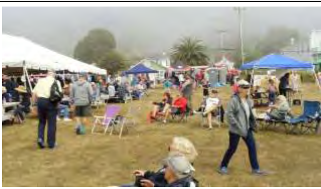
Big crowds all day!