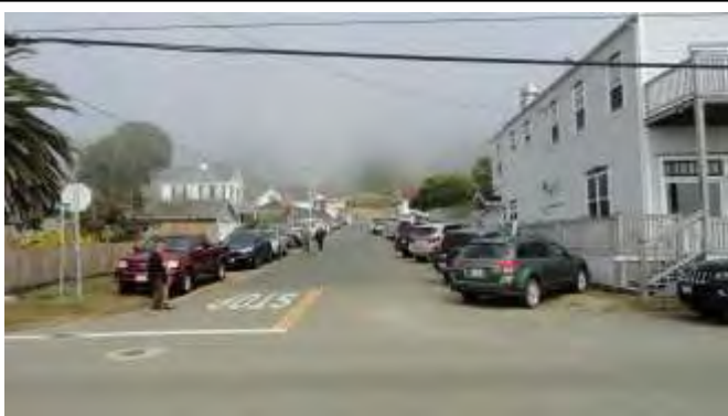
Every street in Westport was jammed with cars!