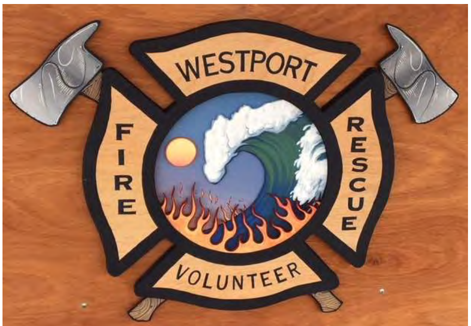
Supporting Our 40 th Anniversary WVFD!

When the pager goes off, whenever possible I will happily put my life on hold to get that downed tree out of the road, to make sure an airplane really didn't crash in Rockport, to herd goats off the highway, and to be there for you in your worst moments. But it takes all of us to make that happen. We need more people like me, but more than that we need people to help us lighten the load, to help do all the things necessary to support my efforts when the pager goes off. Please let us know what you can do to help. It is Westport after all, we'll get creative, it's what we do.