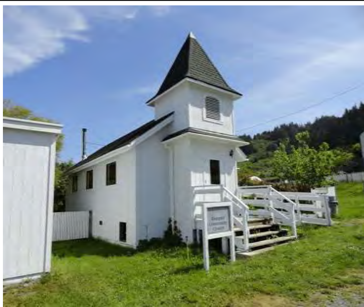
The Westport Community Church