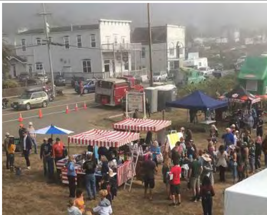
Bird's-eye view of the WVFD BBQ Raffle