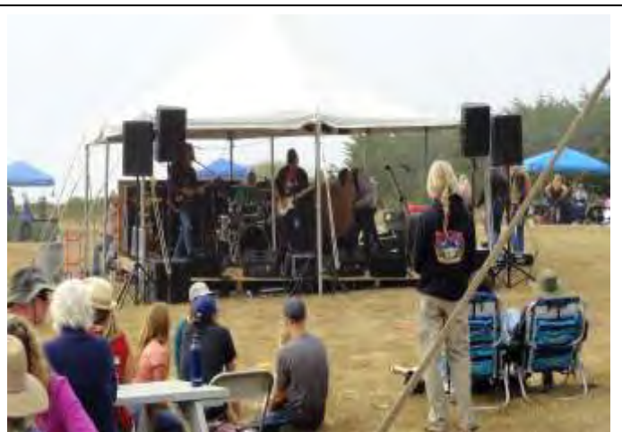
Mixxology playing some rousing tunes.