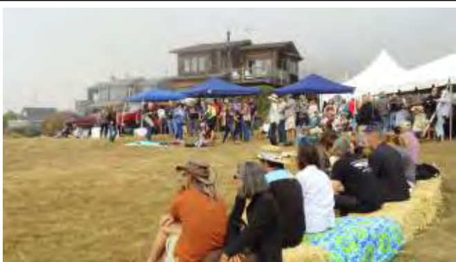
Everyone's enjoying the live bands.

Thanks so much to all of the Volunteers and Donors to the WVFD 40 th Anniversary Fundraising BBQ on August 18 th ! And Even More Thanks to all of the hundreds of folks who came to the BBQ to support the WVFD and have a great day on the Westport Headlands! We all had such a great time!