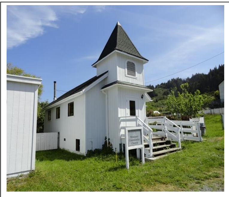
The Westport Community Church

Our October Westport Community Church Board meeting will be held on Sunday, October 21<sup>st</sup> at 11:30AM at the Church – all are welcome to attend!