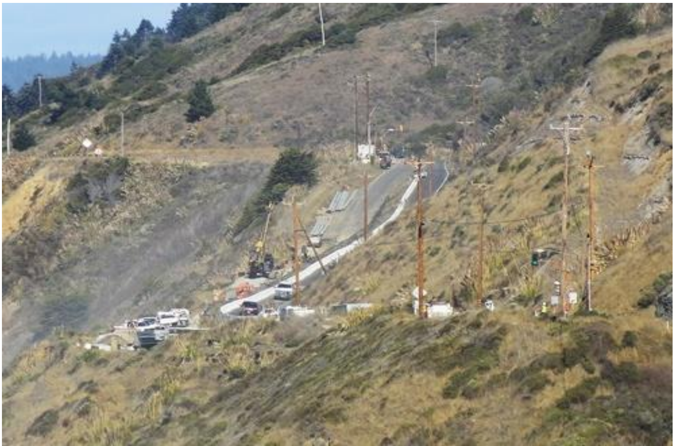
The Westport Slide (and the highway that traverses it) has been slowly moving downhill for generations.