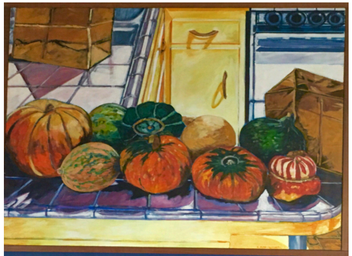
Oil painting by Sue Korhummel

The "You Art What You Eat" art show will hang through Thanksgiving. Be sure to stop by and check it out.