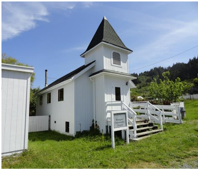
The Westport Community Church