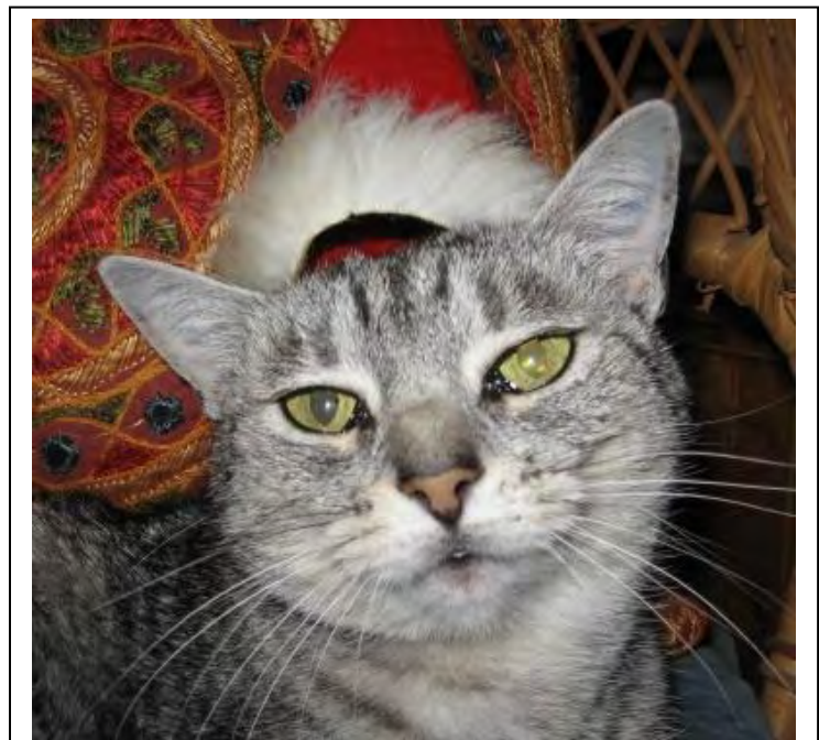
Bootsie – 1998-2017