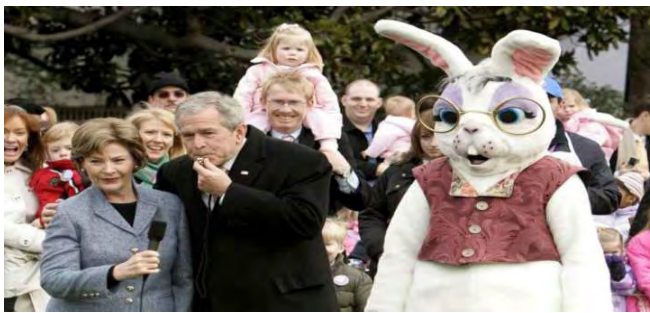
Sean Spicer (as Easter Bunny) in simpler times.