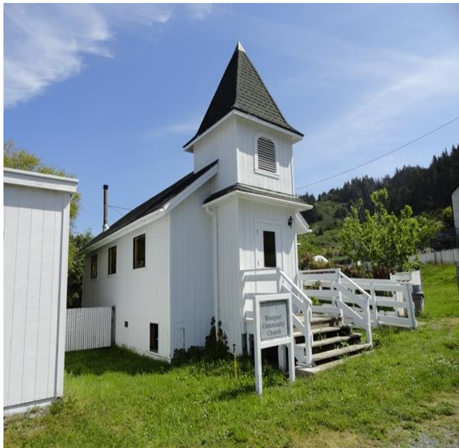
The Westport Community Church