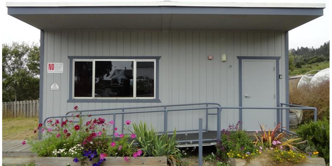
The Westport Community Hall (formerly known as the Westport Community Recreation Center) is ready for your Community Activities!

At its January Meeting, the Church Board approved guidelines for use of the Church and Community Hall that are posted in both buildings. We've also put a calendar at the Westport Community Store where you can reserve the two halls for events. Please sign up on that calendar in advance with your name and phone. The reservations are on a first-come basis. Donations are encouraged when you use the halls to help defray the costs of running the facilities. For now, the Church Board will rely on the community's generosity rather than specifying rental fees. We would greatly appreciate contributions and