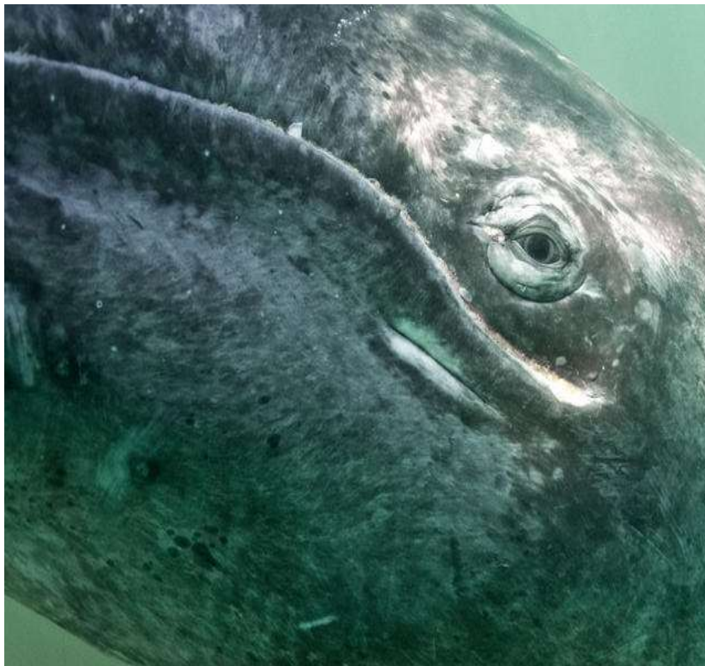
Don't Let The Navy Hurt The Whales!