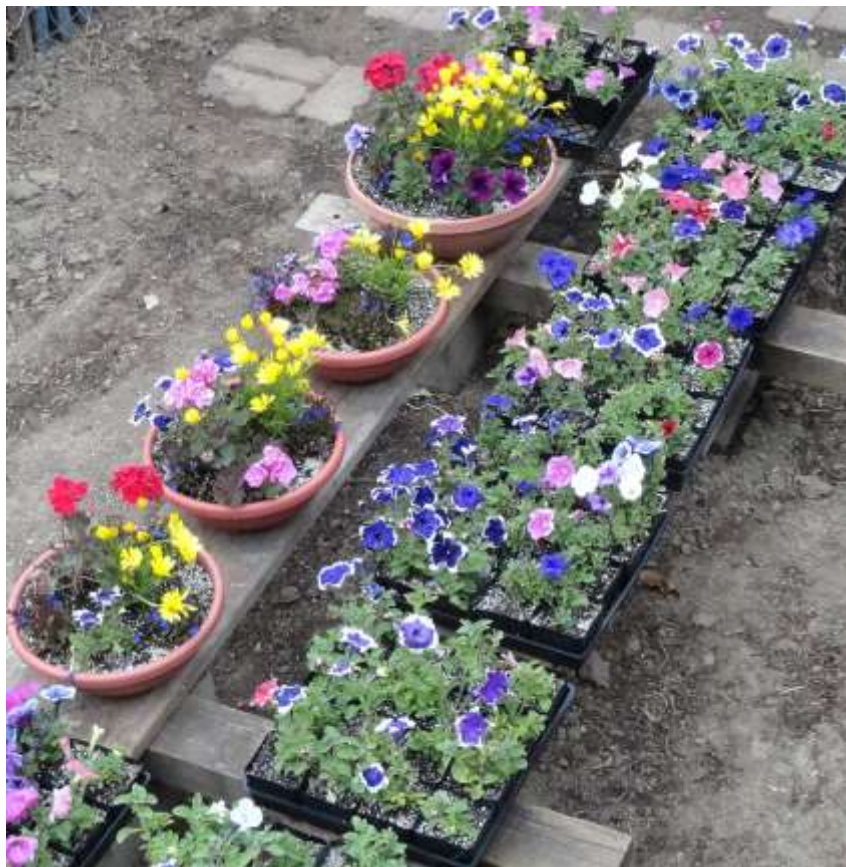
Free Flowers For All Moms at the Ducky Races on May 12 th !