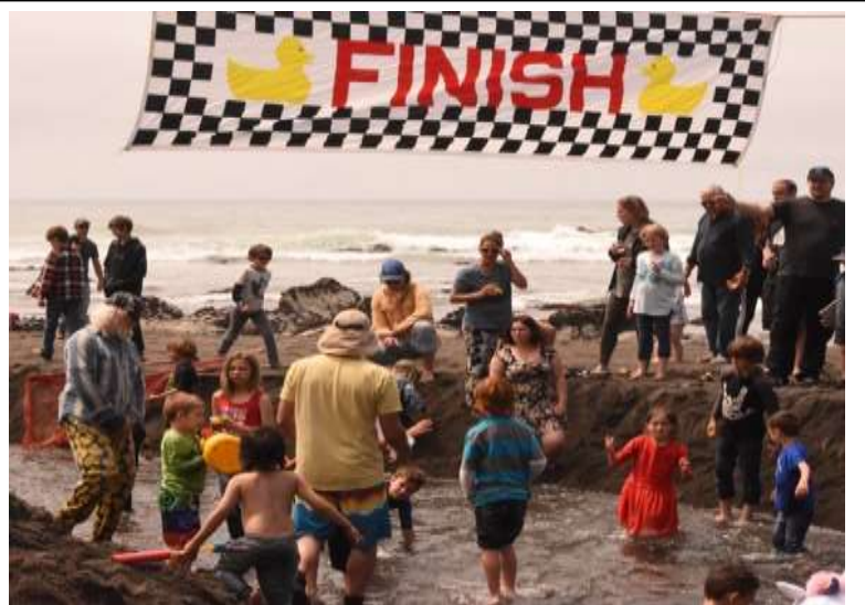
Pandemonium at the Finish Line!

The Westport Rubber Ducky Races this year were once again graciously hosted by the Westport Beach Campground, who have been our generous sponsors for many years. This family event, as always, featured great food, live music, a terrific raffle, and free flowers for all mothers, plus three ducky races on Wages Creek, consisting of the Handcrafted, Kids', and Classic races. The weather was great, and