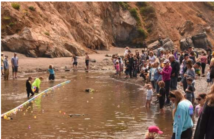
A big crowd was on hand on May 12 th for the annual Westport Mother's Day "Dash of the Duckies"!

Thursday, June 6 th – Bookmobile, 9:00-9:30AM, Westport Community Store