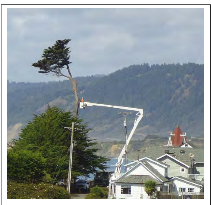
The final cut, which removed the top of the tree after all of the lower branches had been removed.