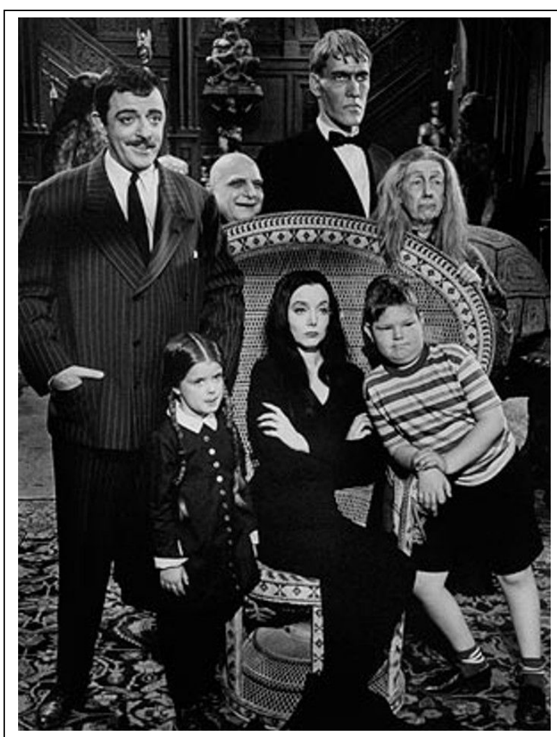
Unless you already look like this, it's time to get your costumes ready for Westport Halloween!