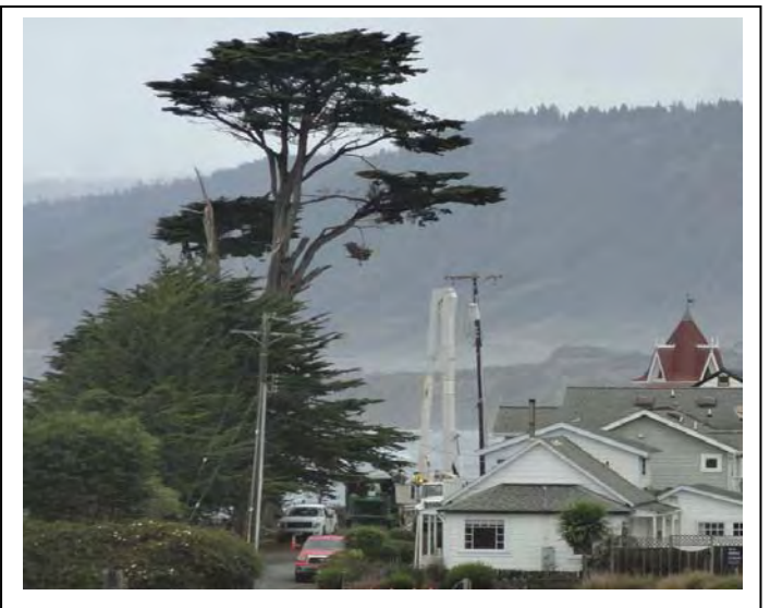
Tree removers getting ready to cut down our 100year-old landmark Westport Cypress on Sept.18<sup>th</sup>.

All you have to do is get off your rear end and go pick yourself some nice fresh veggies (did I mention it's free?), and you'll be surprised how much better they taste when they're picked fresh like that compared to that days-old stuff you get from the grocery store. In October at the Westport Community Garden, we'll have romaine lettuce, butter lettuce, red leaf lettuce, arugula, Italian parsley, cilantro, onion chives, French thyme, Greek oregano, lemon balm, green curly kale, mixed purple kale, Chinese snow peas, strawberries, Italian green beans, zucchini squash, lemon cucumbers, mini yellow tomatoes, green string beans, broccoli, lots of young, tender carrots, and even some full-size Early Girl tomatoes. Stop by the Garden frequently, and Don't Panic, It's Organic – we never ever use pesticides or chemical fertilizers 'round here, and we've got everything for you but the salad dressing!