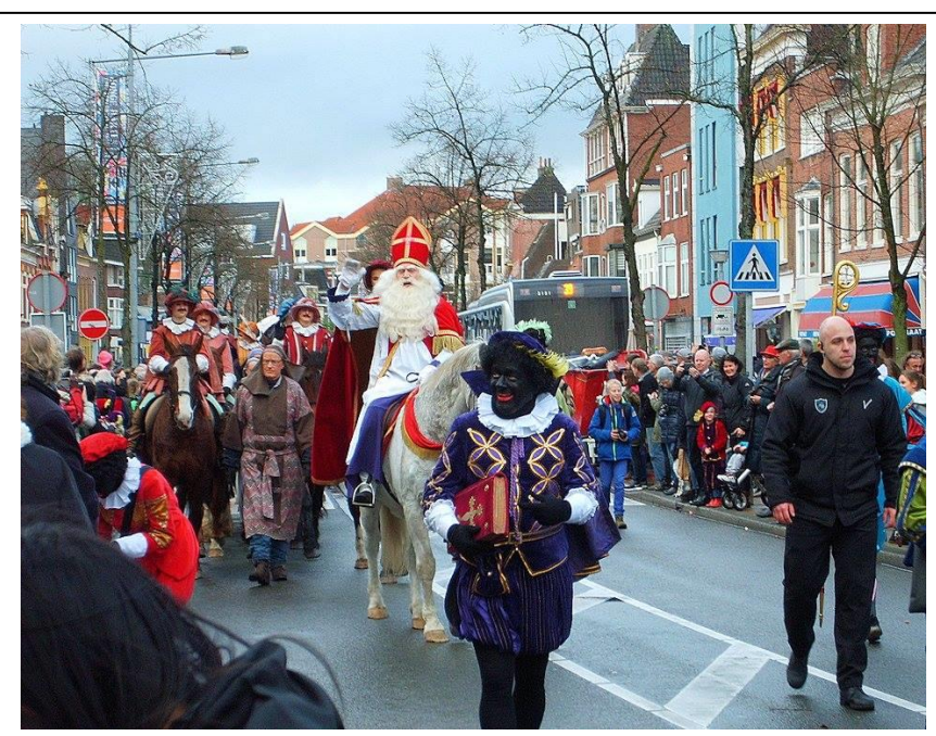
Sinterklaas in Groningen, Netherlands in 2015