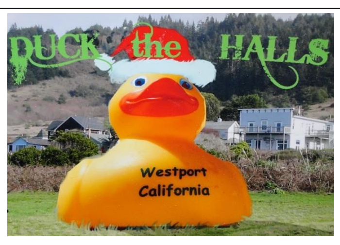
HAPPY HOLIDAYS!