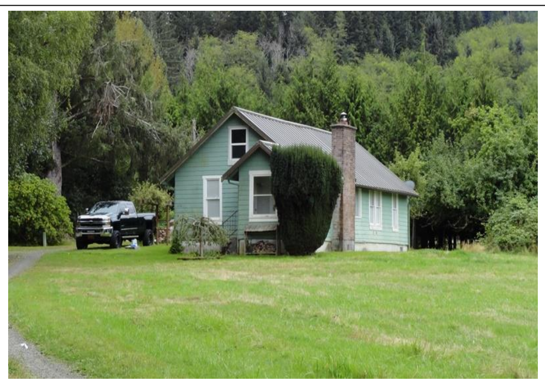
"When you see a Forks in the road, take it!" - Yogi Berra

Forks is a friendly, self-sufficient town of 3000 people, just 14 miles inland from the beautiful small tribal seaside town of La Push. We are in the middle of a vast tree farming region, which is managed as an eco-friendly renewable natural resource. On average, we do get a lot of rain here (100 inches a year), which is why Donna and I love it here so much. Even if it's a dry year, we still get a lot of rain, and we are always green. Here we have all the goods and services available that we have come to expect in Fort Bragg, and yet we are still just a one-stoplight town with all businesses locally owned and operated — no chain stores of any sort. Everyone knows everyone, just like in Westport, and we all care for one another while still respecting everyone's individual freedoms. A