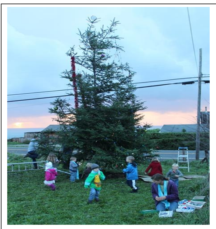
Come join the fun on December 15<sup>th</sup>!

Activities will include holiday crafts, decorating the tree, the tree lighting itself, a visit from Santa, and a Holiday movie. Ornament making will be from 3:00PM to 4:45PM at the Community Center. At about 4:45PM, we'll head down to the tree site across from the Westport Community Store and let the kids finish decorating the tree. The plan is to plug in the tree around 5:15PM, and then head back up to the Community Center for a visit from Santa and a holiday movie with popcorn, hot cocoa, and hot apple cider. Anyone is welcome to come participate and watch all the fun, or at least be there for the lighting of our Westport Holiday Tree!