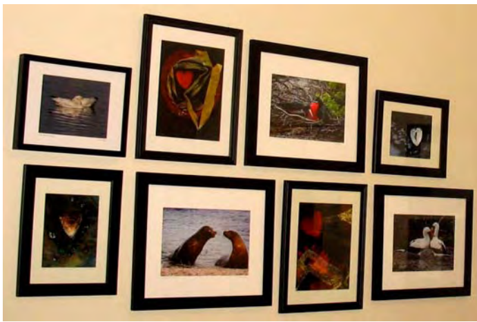
The Love Show at the Westport Hotel