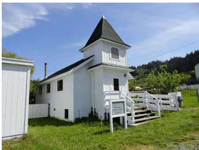
The Westport Community Church