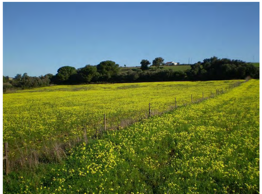
Oxalis pes-caprae , a bulb originally native to South Africa, is naturalized in many parts of the world, including Westport.

Our wet fall/dry winter pattern this year has been just what many of our wildflowers like – especially those that have become naturalized from other countries. The bright yellow flowers you see all over town right now are of Oxalis pes-caprae (also called Sourgrass or Bermuda Buttercup), a tiny bulb which is originally native to South Africa. This year it's really