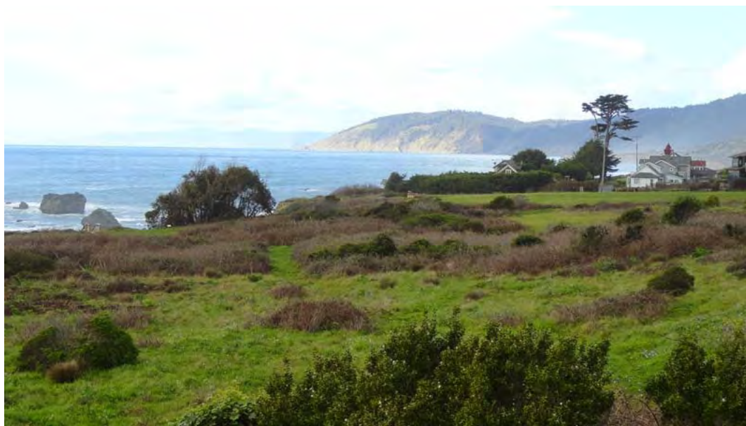
The Westport Community Headlands