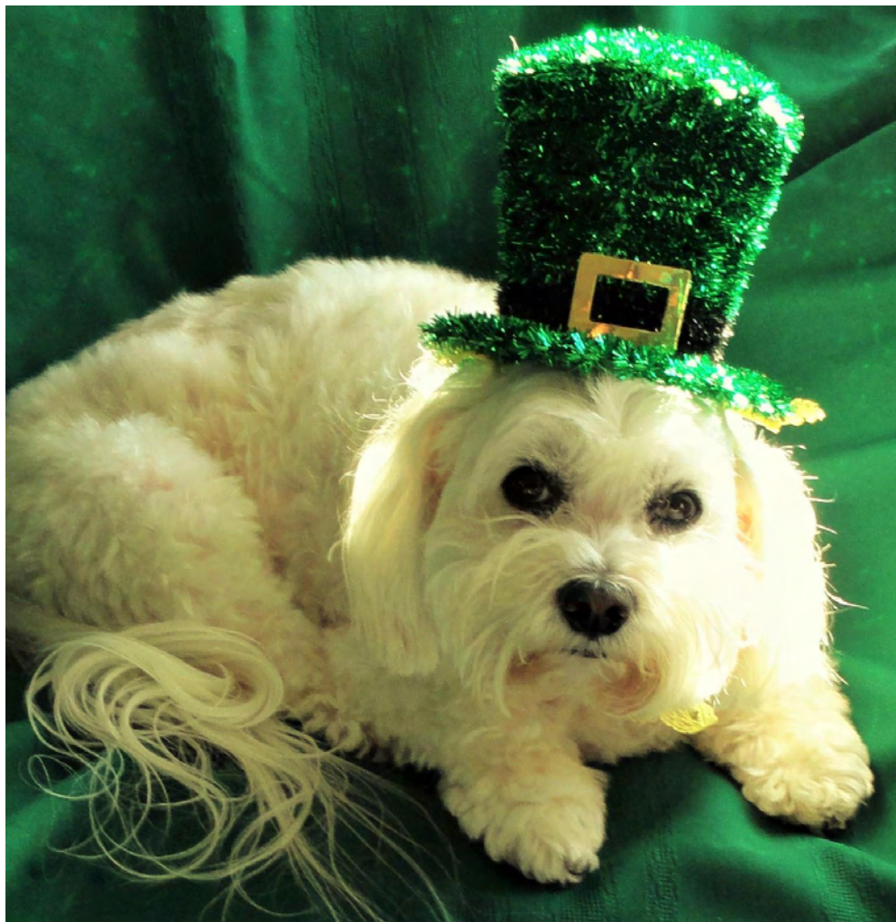
Everybody Gets to Be Irish On Saint Patrick's Day!