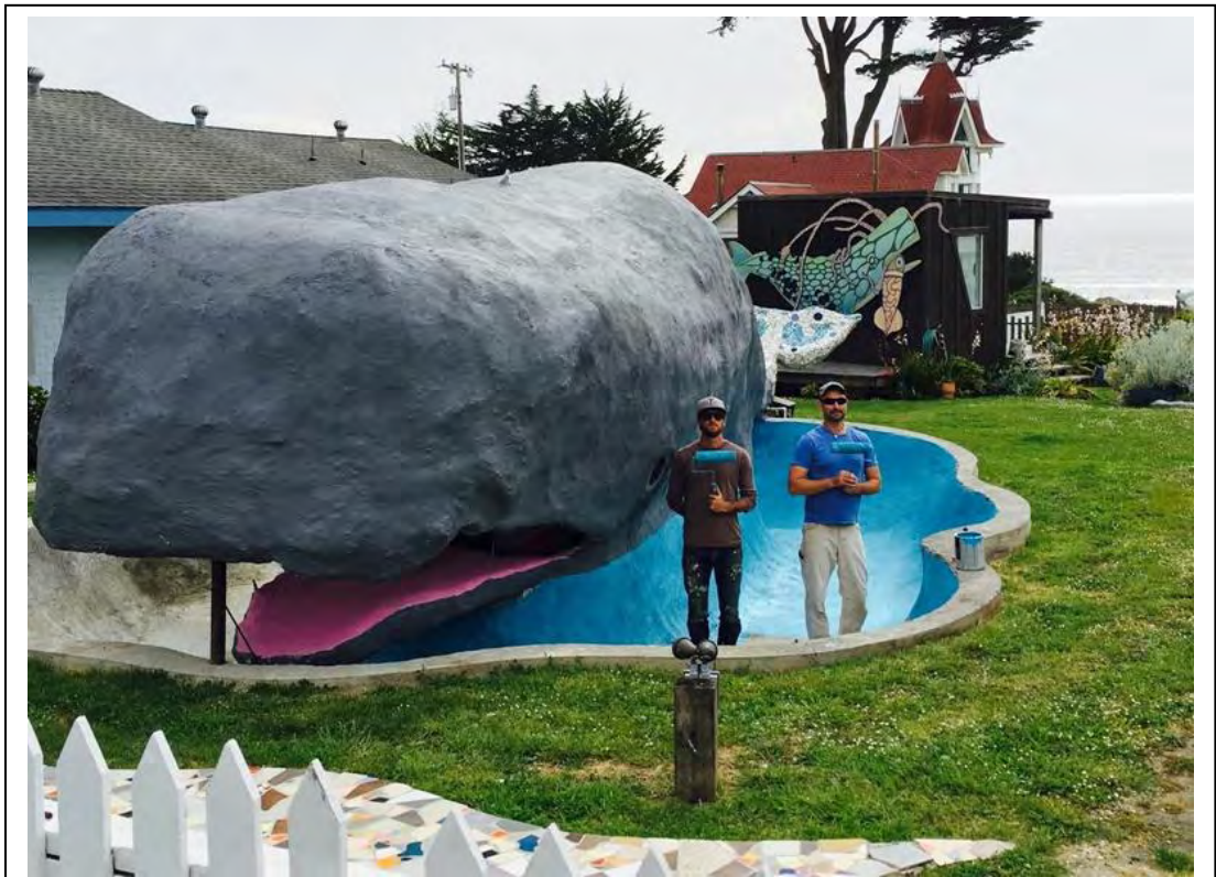
The Westport Whale will host our 2 nd Annual Whale Festival March 24 th !