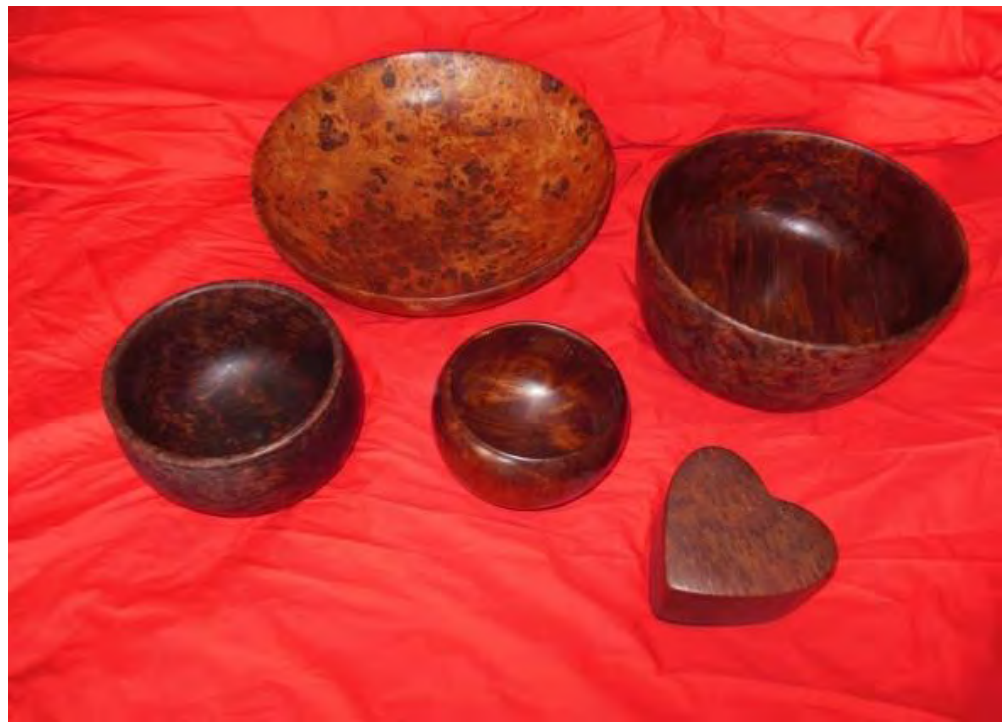
Jeff Saunders made beautiful bowls from native wood

The Westport Village Society Mini-Grant Program awards grants in three different community service categories: 1) benefit/beautification of the community, 2) events, and 3) outreach. Funds are available again this fiscal year, through June 30 th , 2018. Please see the Mini-Grant Application Form on our WVS website www.westportvillagesociety.org for details.