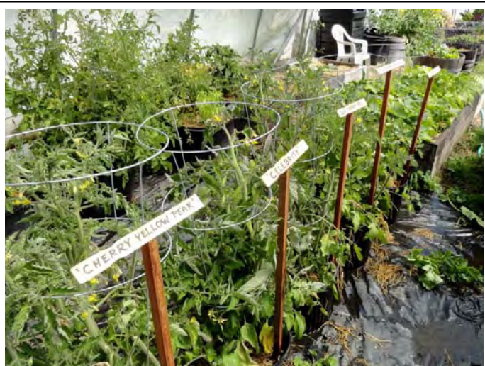
Tomatoes in the new Community Garden.

Since we got a late start this year, we're still waiting for our tomatoes to ripen, but that just means we'll have a bumper crop in September and October (and hopefully even later), with over 15 varieties to choose