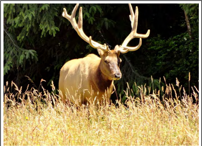
Happy resident of Prairie Creek Redwoods Park.

Sometimes it's nice in the summer to "get away from it all" for a couple of days. Even if you don't have much time or money, there are many great places to visit relatively nearby. One of our favorites is Prairie