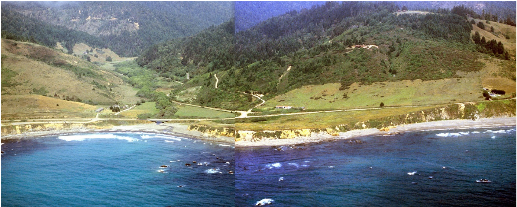
1987 Aerial Oblique with Branscomb Road in center.