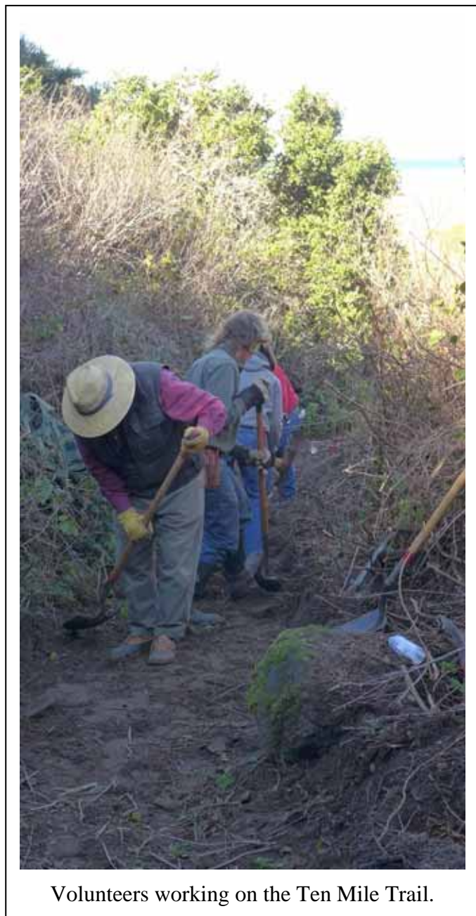
Volunteers working on the Ten Mile Trail.

You may not know that the lands on both sides of the bridge were acquired by the MLT from a private owner this past summer. The MLT will manage them for public access and resource conservation purposes. This means you are free to walk the haul road east along the river to its intersection with the modern gravel quarry road. It is a great place to visit if you are a bird watcher or just love getting out in nature. The Ten Mile River estuary is now a Marine Protected Area that hosts several endangered and threatened species. It is a fascinating place to visit.