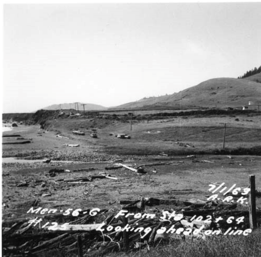
In this month's historic photo, here's the view north across the mouth of Dehaven Creek on July 1, 1963, before the new Highway One bridge was built.

Since now is the time for New Year's Resolutions, I've added one to my personal list, and that is to attend at least several WCWD open monthly board meetings (which are held on the second Saturday of every month at 10:00AM at the Firehouse) in 2017. Food for thought?