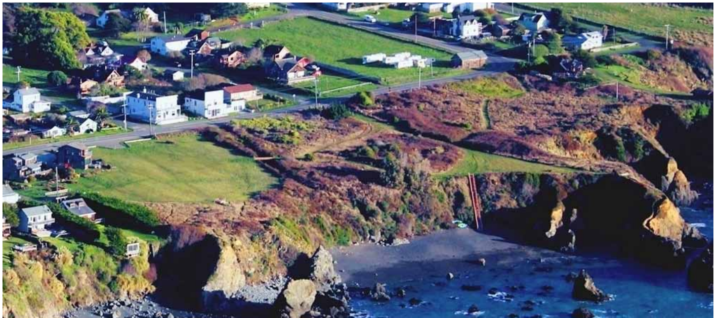
The Westport Community Headlands Park

Published by the Westport Village Society, P. O. Box 446, Westport, CA 95488