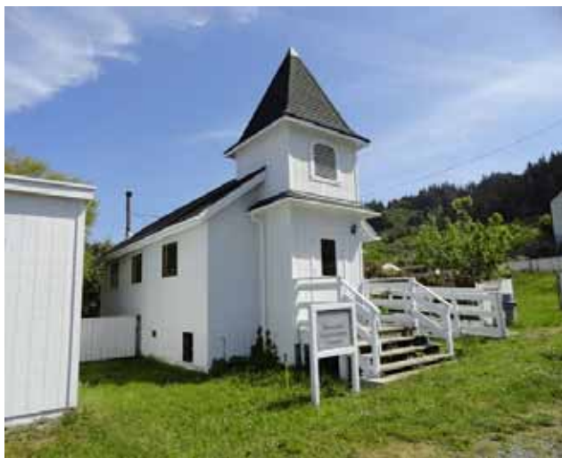
The Westport Community Church