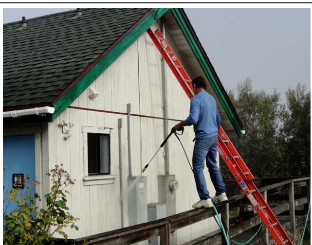
Picasso Sosa painting the Westport Church

Give your neighbor a helping hand? Sounds good, but how do you know your neighbor needs one? How do you know when your neighbor is sick or injured and just taking out the trash is a monumental task? Sometimes when the old bones hurt, a lot of the things we used to do are just too much and it all piles up and you just give up.