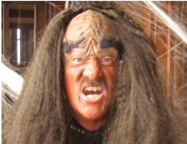
Your humble Editor, by the time he finishes yet another issue of The Westport Wave .