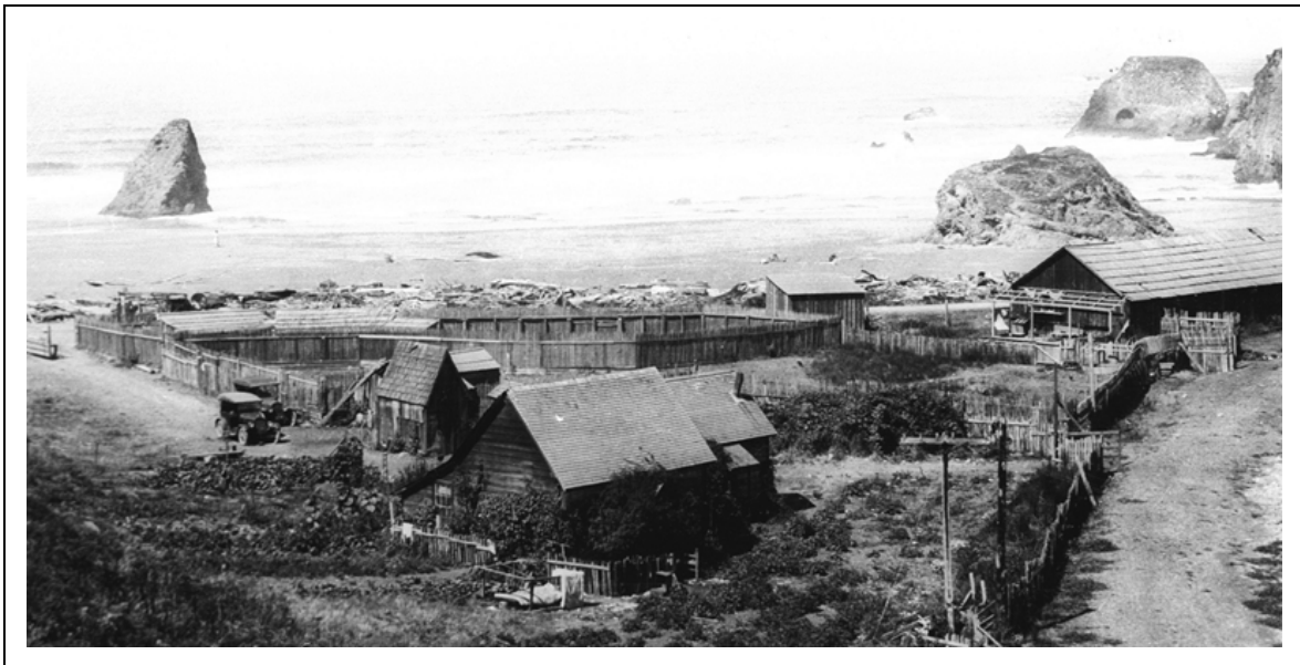
Seaside in the 1910s

Please join us at the Westport Village Society Annual Member Meeting on Friday evening, October 2<sup>nd</sup>, at the Westport Community