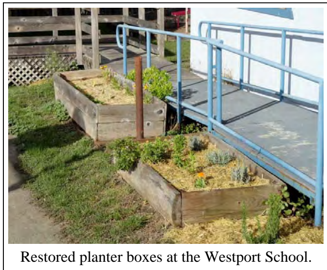
Restored planter boxes at the Westport School.

On the roof, check the chimney cap screen (you have one, right?) for any debris. If you see any ash or build up the chimney it probably needs to be swept. Remove the cap and shine a flashlight down the chimney. If you see buildup or obstruction of any kind, chimney sweeping is indicated. Also check that the chimney pipe is stable and doesn't wobble. If any problems are found, maintenance and repairs should be done now, making the heating system ready to go prior to heating season. Inspection can be done by many homeowners, but if you are unsure contact a professional. Your best bet by far is to have all major repair done by a reputable professional. Then, you will be able to safely enjoy your nice, warm house, all winter long, knowing that you're FIRE SAFE!