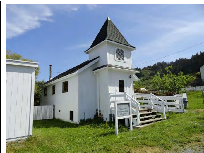
The Westport Community Church