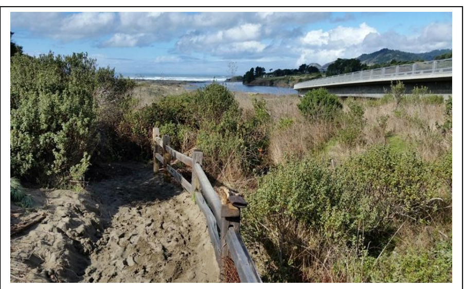
This Ten Mile Trail needs some work! Read this article to see how you can help!