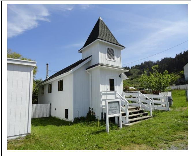
The Westport Community Church