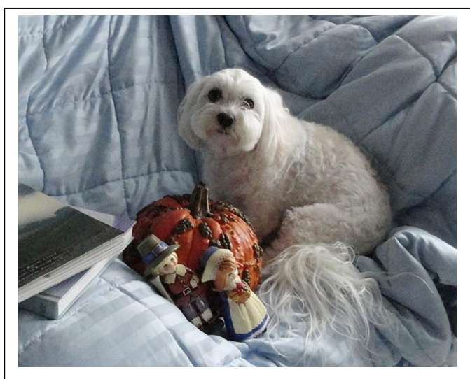
Time to get out the cookbooks!