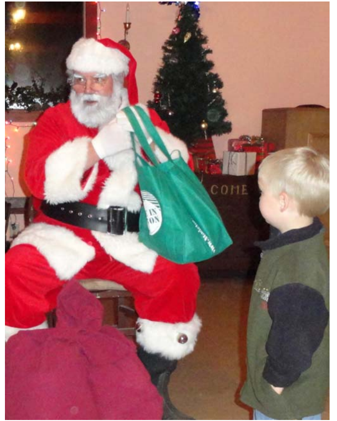
Santa Claus distributes presents during his visit to Westport two years ago.

HAPPY HOLIDAYS to you all, and to all of you in our wonderful home of Westport, California!