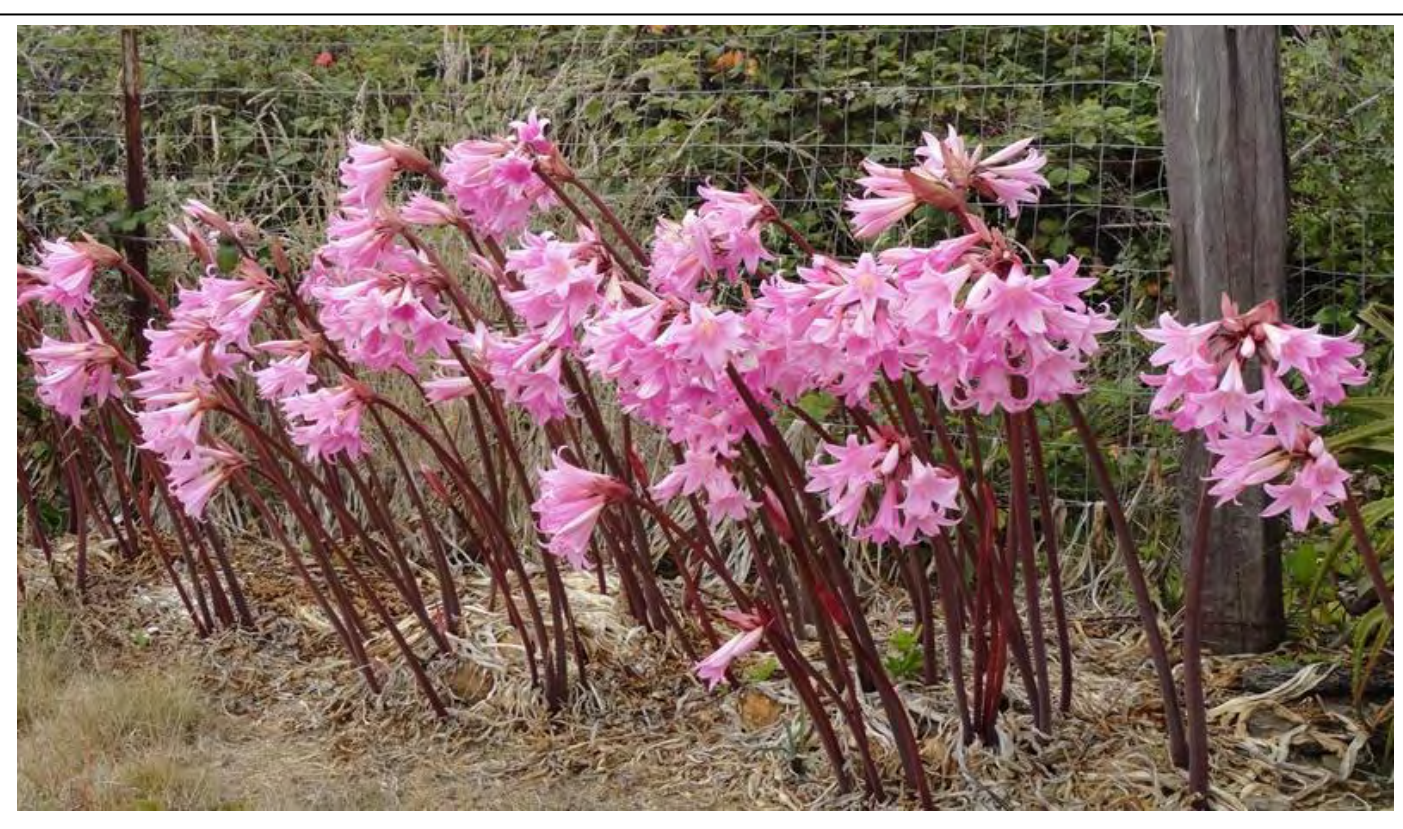
Blooming now, our many naturalized "Resurrection Lilies" here in Westport symbolize eternal life.