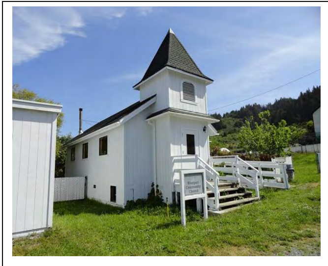
The Westport Community Church