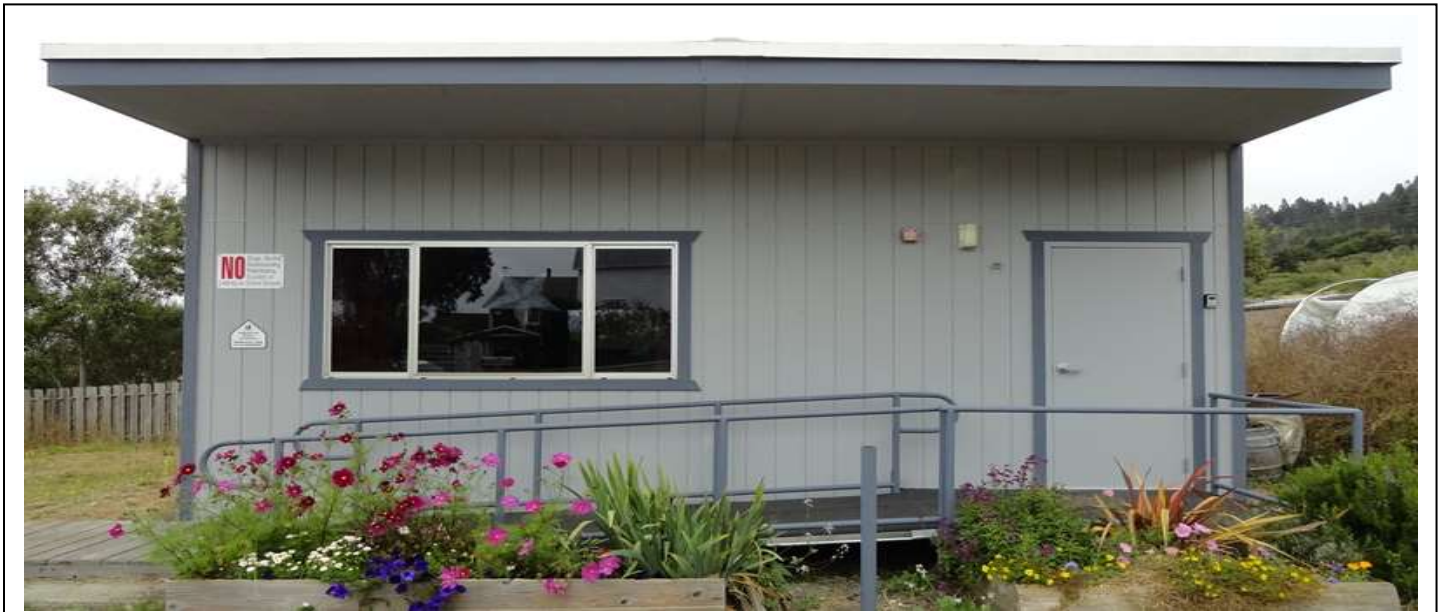
The Westport Community Hall is an important Westport community resource