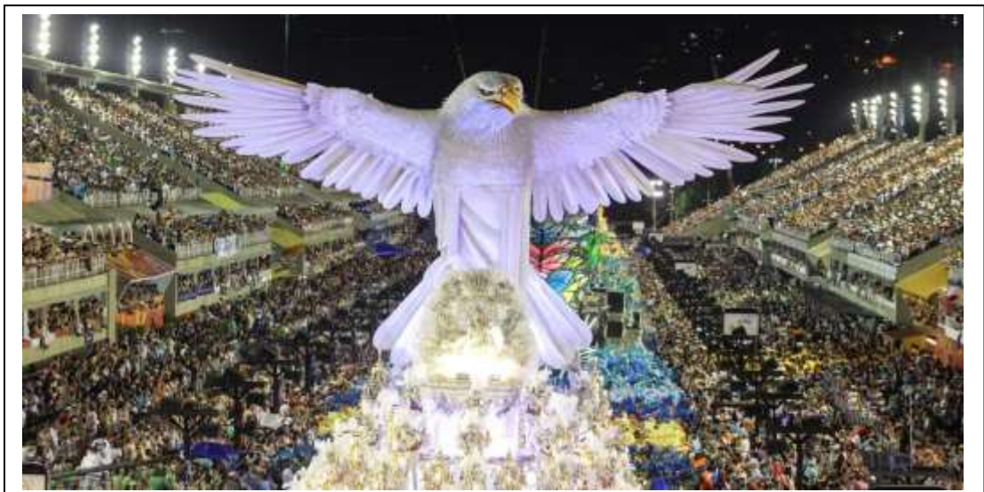
Carnaval do Rio de Janeiro, Sambadrome Parade

Everyone could always use an extra day, and to finish off February 2020, you'll get just that in the form of Leap Day, February 29 th . This extra day happens every 4 years, because if it didn't, in 700 years Christmas would be in summer for us (but it would be in winter for Australia, which should really please them, and I'm surprised that they ever went along with the whole thing). In any case, on February 29 th , according to ancient traditions, a woman can propose marriage to a man without penalty. Now this being the 21 st Century, I don't see why that couldn't happen on any other day. But here's the catch – according to a real medieval law , if a man says "no" on February 29 th , he has to give the woman 12 pairs of gloves! (I am not making this up.) So why not give it a try – and if needs be, tell him to give you some nice, sturdy gloves, so you could use them working around the yard or something. (All this because 2020 is divisible by 4 but not by 100 [except by 400], and "w" is not a vowel this year!)