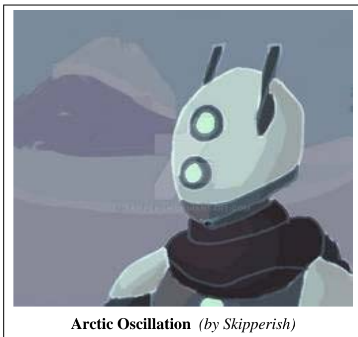
Arctic Oscillation (by Skipperish)

Worldwide, there are actually a whole bunch of major air and ocean circulations that can be just as powerful, and they can all influence one another. Just as The Blob can be a major West Coast winter storm blocker these days (it is in summer and fall as well), a big storm maker nationwide can be what you may know as the North Polar Vortex, or Arctic Oscillation.