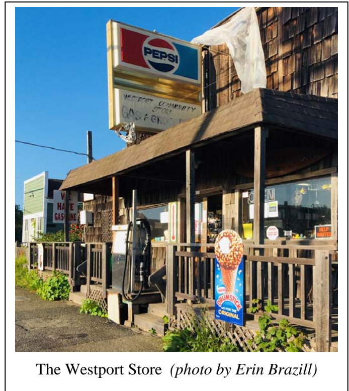
The Westport Store

The Westport Village Society urges you to take the opportunity to maintain your health with outdoor activities such as walking in the Headlands Park and other wild places. Our mission is to support land conservation and our community. We wish you good health and enjoyment of outdoor recreation opportunities as we weather this period of difficulty.