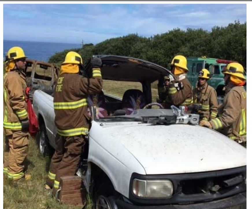
Firefighter training on the use of the "Jaws of Life" in Westport on June 13 th