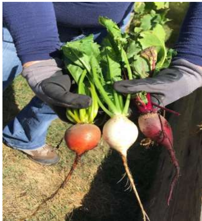
Fresh beets and other great veggies now at WCG!