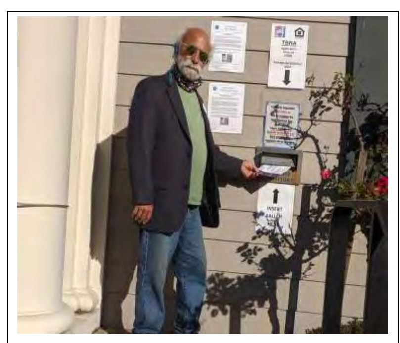
VOTE NOW!! You can drop your ballot at the Fort Bragg City Hall anytime up to and including Election Day, Nov.3<sup>rd</sup>, but the best thing is to DO IT TODAY!