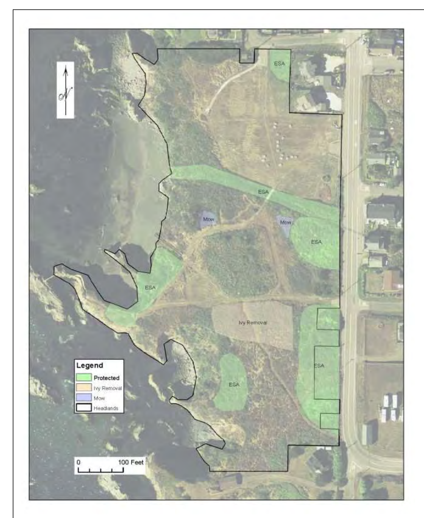
Westport Community Headlands Vegetation Management Map (see page 6)