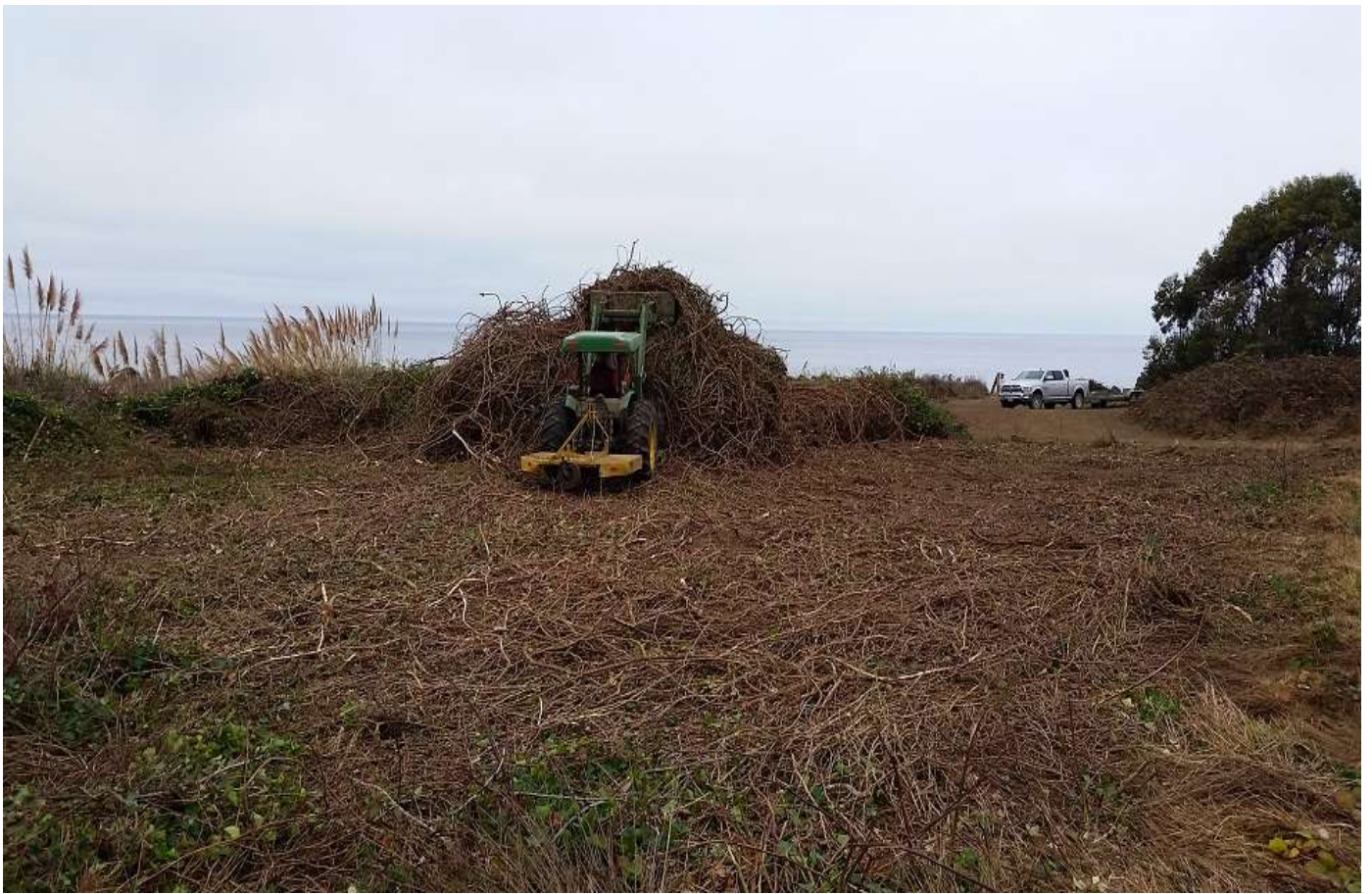
Aggressive exotic Ivy chokes out native plants without providing good habitat for native animals.