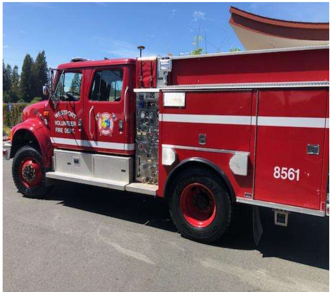
The new WVFD Engine #8561 will be the first engine out on most calls.

We are very grateful for our community's ongoing support of our operations, especially as we approach what could be an active fire season.