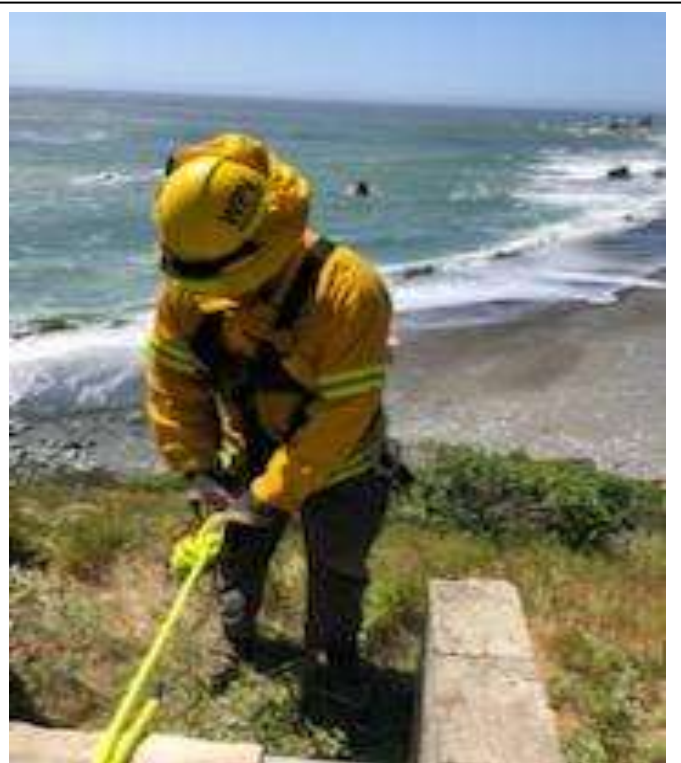
WVFD Cliff Rescue Training

We are currently completing the paperwork for a new ISO (Insurance Services Office) survey that we anticipate a little later this year. Our last survey, in 2014, led to an improved ISO rating of 05/5X. Since a Department's ISO rating can affect the availability and cost of fire insurance, we would like to improve our rating from 05 to 04, or even to 03 (under the ISO rating system, a lower number is better). One of our challenges is that the hose testing machine we had been borrowing from Fort Bragg Fire is no longer available. We are trying to raise money to buy a hose testing machine of our own. With sales tax and shipping the most economical dependable hose