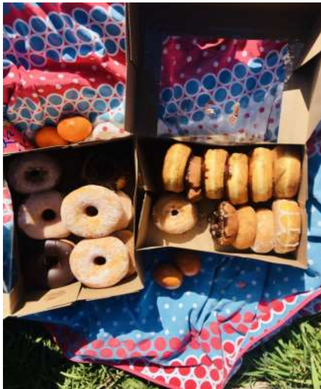
Treats available at the monthly Westport Headlands Work Party!

ocean, and each other's company. Before the work parties, I didn't know these guys, and they are truly treasures in our community. Friendly, knowledgeable, and so tireless, they put me to shame.