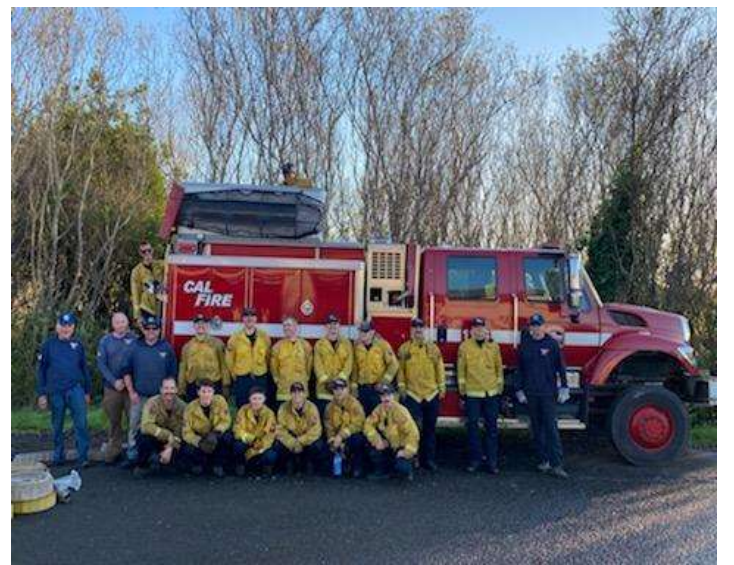
November 20 th Saturday WVFD Training, with WVFD members in blue and CalFire crews in yellow.

The Westport Volunteer Fire Department is having a busy and productive year in 2021. Our volume of 911 emergency calls continues to be higher than it has been in the past. Since 2019 we have averaged 88 emergency calls a year. This is 57% higher than our previous three-year average of 56 calls a year.