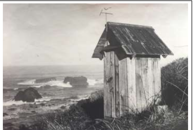
The Flying Outhouse

It had been storming for days and on this particular night there was a big wind storm that arrived from the East that was really unusual, knocking out the power and telephone and bringing leaks to the house we never knew we had. It raged all night but the morning dawned clear. I was up early to check the storm damage and make coffee. Going outside I could not believe what I didn't see. Our outhouse had disappeared! It had blown over before on its side in big storms but this time it had vanished! I went to the bluff edge and looked down to the beach 60 feet below and there it was. Like a crashed rocket ship, the peak of the roof buried in the sand. After thinking with a cup of coffee and waiting for the sun to rise I looked to see if there was any smoke coming out of the Morgan's chimney. Dave always had good ideas and was a great friend. I needed his help on this one. Nobody was up yet. But what I did see looking east I could not believe!