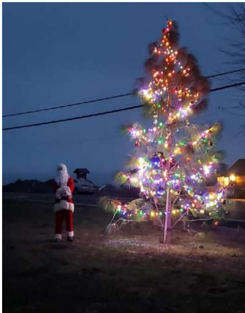
The Westport Christmas Tree