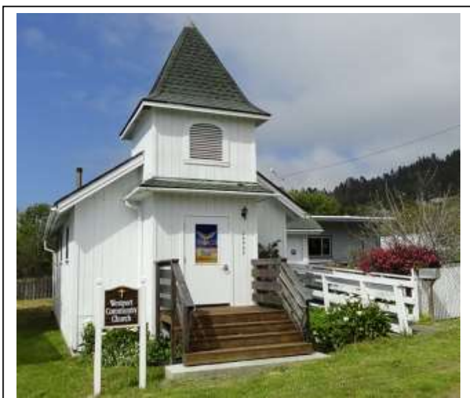
The Westport Church

Learn simple practices to cultivate inner peace through meditation. Satsang with Babaji at the Westport Church, 2 nd Sunday, April 10 th at 2:00PM. In the coming months, Babaji will also lead a Satsang at the Westport Church at 2:00PM on May 8 th , June 5 th , and July 3 rd . Be there!