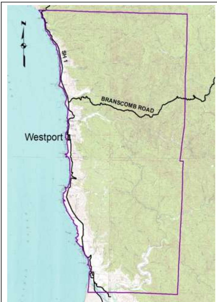
Membership area for the Westport Church

membership is restricted to individuals over 18 years of age whose primary residence is within Townships 20 North and 21 North of Range 17 West of Township 21 North of Range 18 West of the Mount Diablo base meridian (see map above). Membership is not restricted by Spiritual orientation.