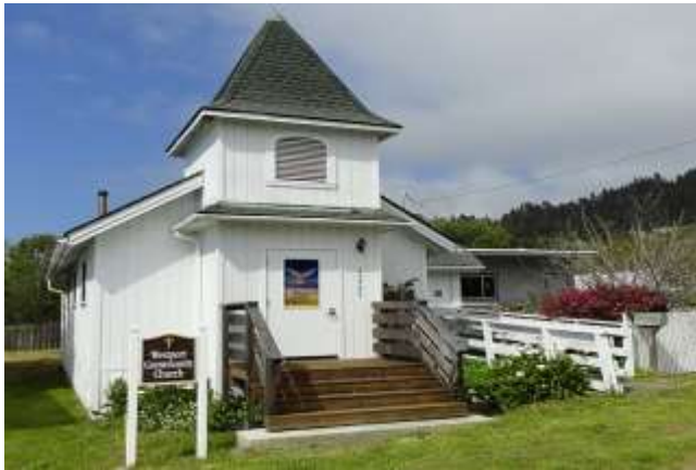
The Westport Church