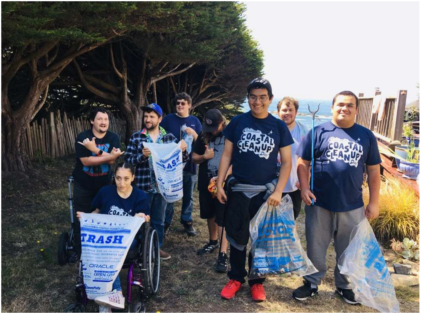
Another successful Westport Clean-up Day!