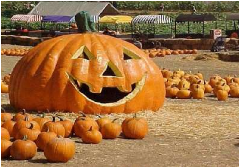
HAPPY WESTPORT HALLOWEEN! (see page 4)