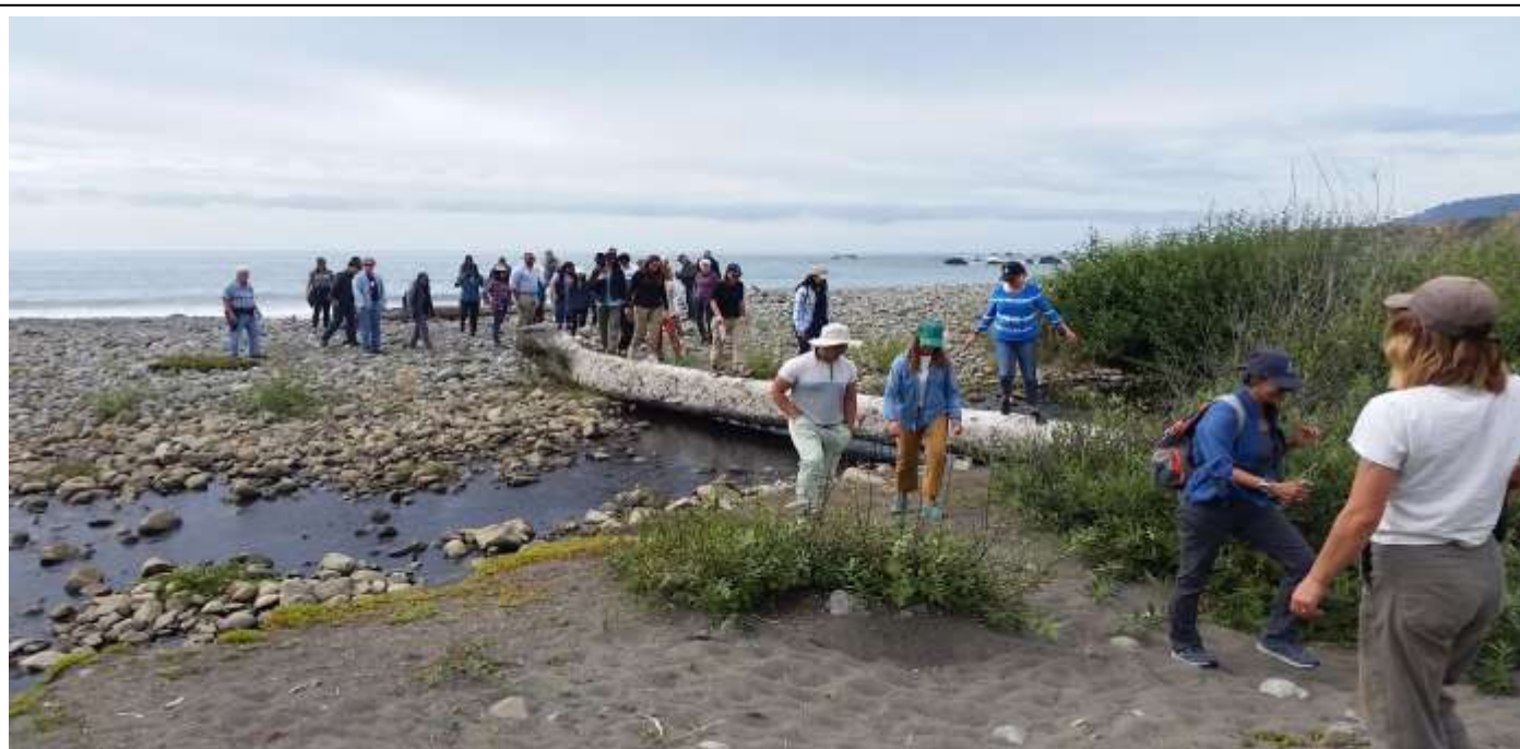
Conservancy and local supporters touring DeHaven Beach on September 21 st , 2022.

Published by the Westport Village Society, P. O. Box 446, Westport, CA 95488