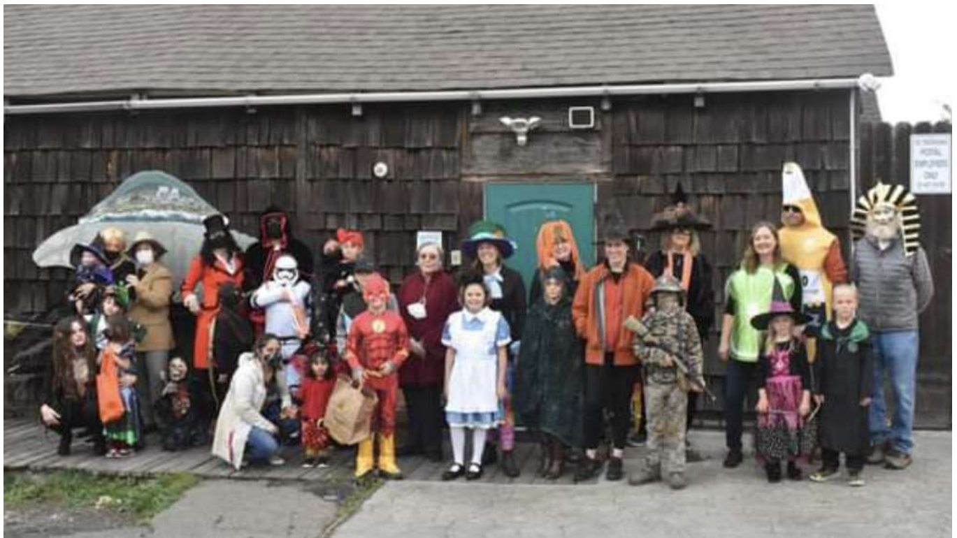
Celebrate Halloween in Westport! (at last year's Westport Halloween festivities)