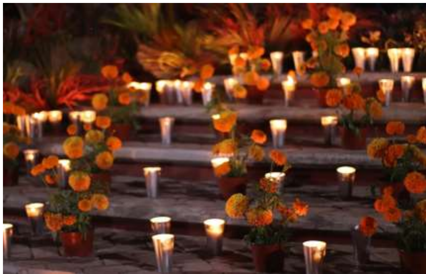
Honor our dear departed at the Westport Cemetery November 5th

they might have liked in life. We are also hoping that there can be a potluck of finger foods at the cemetery in addition to the provided hot chocolate and 'pan muerto'.