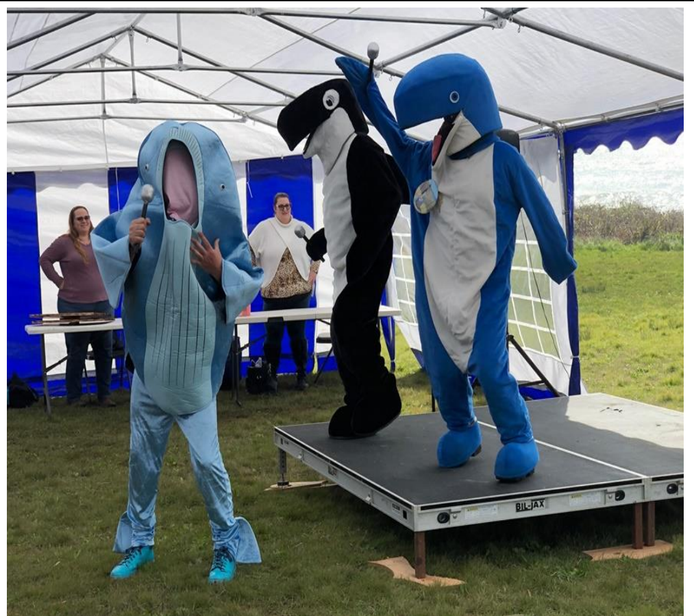
The Westport Whale Festival Is Back This Year! Be there March 25 th !