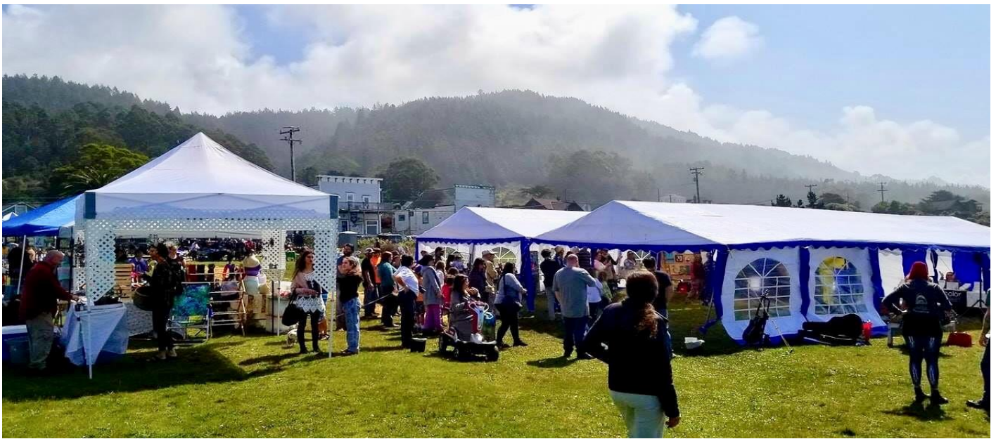
Much of the 2023 Westport Whale Festival on March 25 th will take place on the Westport Headlands.

The event will be focused on the Westport Headlands, with some activities around the Westport Whale at Kyle's house just north of the Westport Inn.