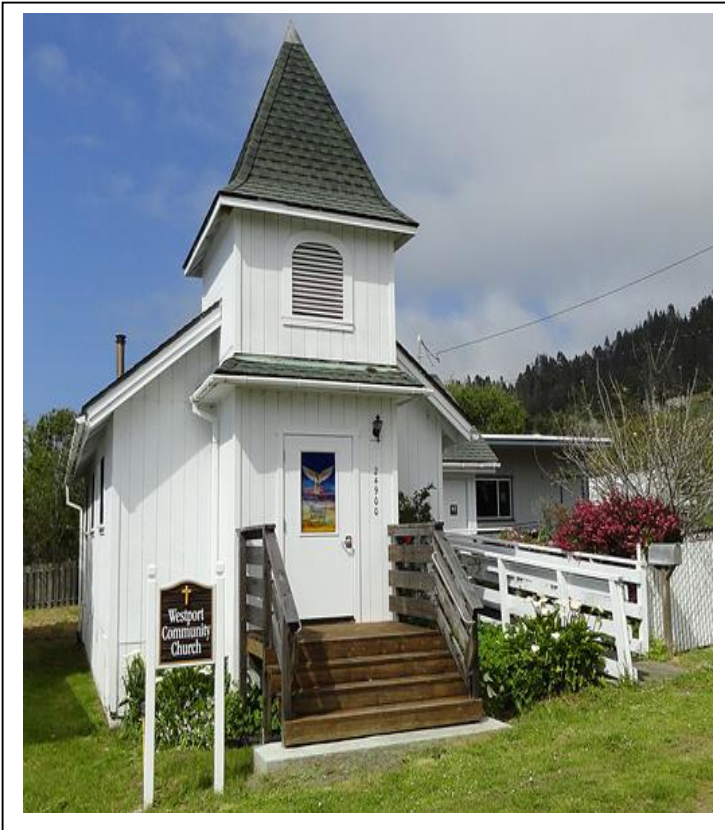
The Westport Church