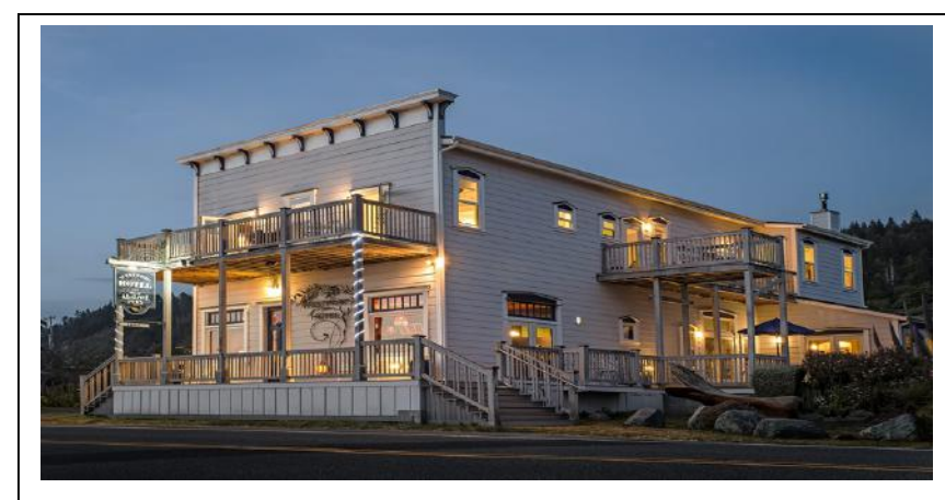
The Westport Hotel and Old Abalone Pub

The next meeting of Westport's Fire Safe Council is Saturday, March 11, 2023 at 10:00AM at the WVFD Firehouse. We welcome all district residents. This council hopes to help residents protect their homes, our community, and our rural environment from catastrophic wildfire.