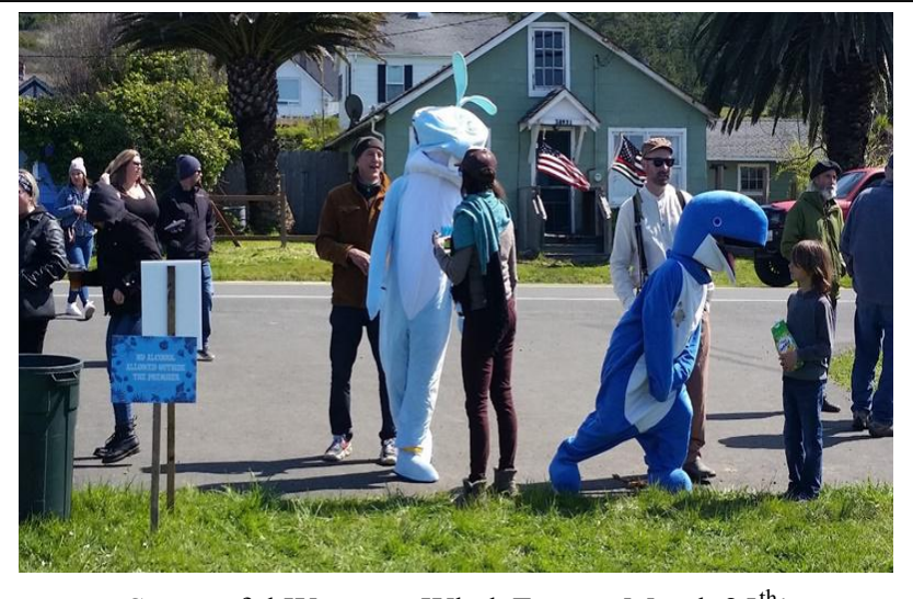
Successful Westport WhaleFest on March 25<sup>th</sup>!