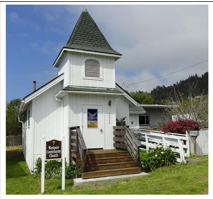
The Westport Church

"Without suffering, you cannot grow. Without suffering, you cannot get the peace and joy you deserve. Please don't run away from your suffering."