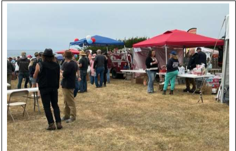
Thanks to all for a successful WVFD Fundraiser on August 19 th !

Our fundraising event on Saturday August 19 was very successful. Several hundred people enjoyed great live music, good food and drinks, and the chance to reconnect with old friends and make new ones. The weather cooperated and a CalStar helicopter dropped in to pay us a visit. More than twenty craft merchants had their wares for sale, and the silent auction drew bids on many special items. The fundraising event raised close to $15,000 which will go a long way towards making it possible for the Fire Department to acquire the medical rescue and fire fighting slide-in units for its new all-terrain emergency response vehicle. We are very grateful for our community's ongoing support!