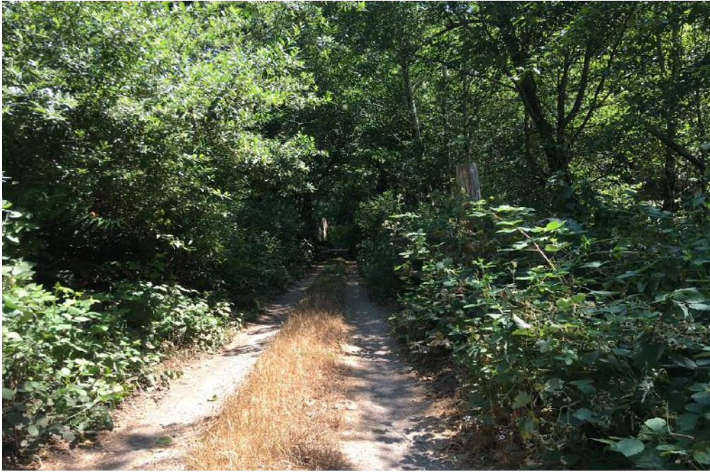
Roadside Brush Clearing Before

Department ambulance or fire trucks to pass safely and turn around on each road. After our project finished, some residents on nearby roads hired the crew to clear roadways and defensive space around their homes.