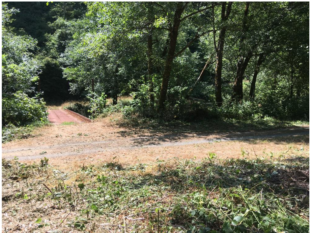
Roadside Brush Clearing After

We were able to hire Elk Ridge Tree Service to do roadside fuel reduction on Howard Creek Road and Ponderosa Road. They cleared brush, limbed lower branches on trees and removed small tree sprouts enough to allow the Westport Volunteer Fire