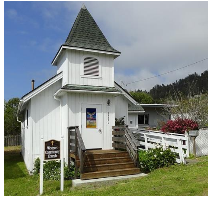
The Westport Church