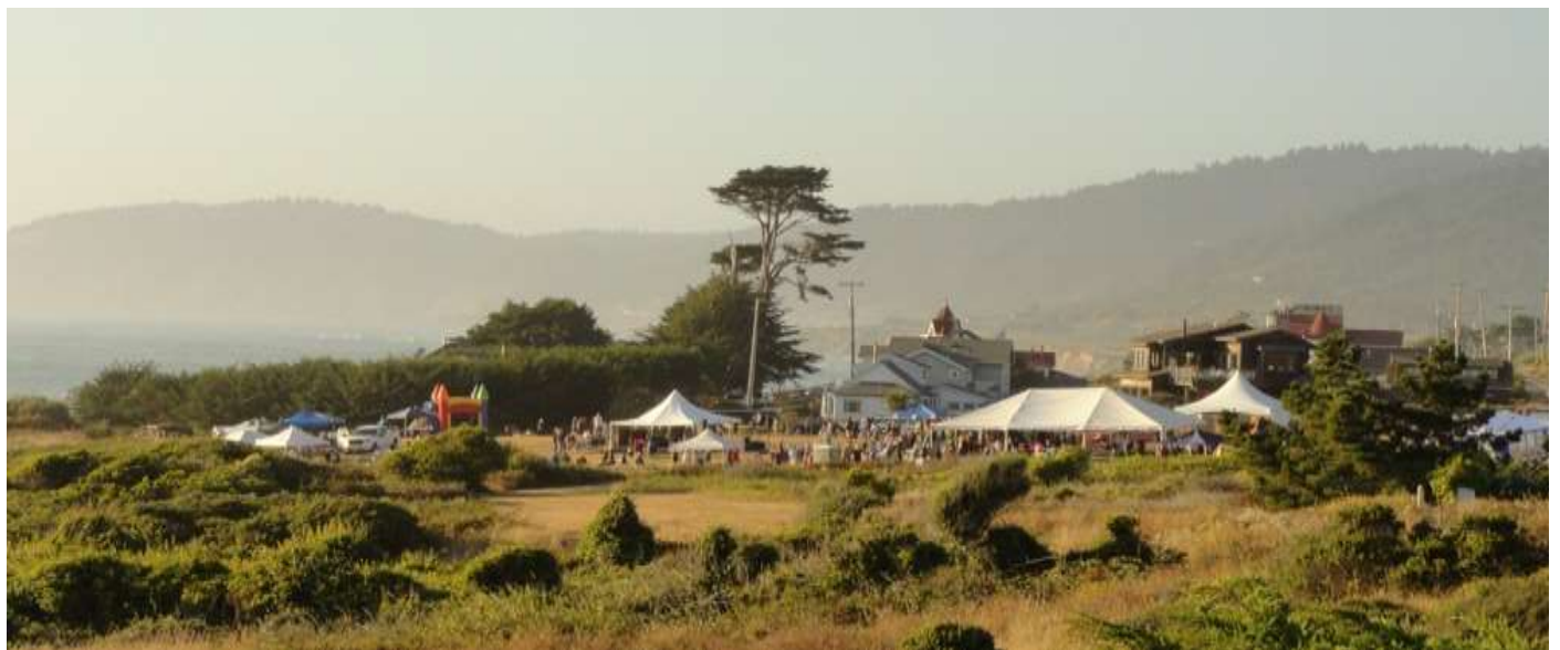
WVFD Barbecue 2019