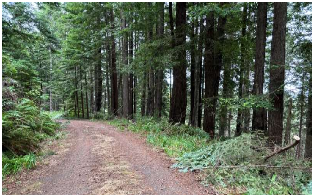
After Roadside Clearing

Thank you for your help in making our Community more Wildfire resilient!