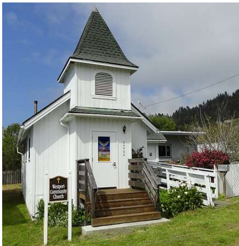
The Westport Church