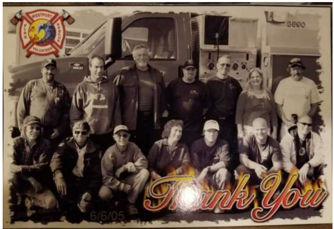
The WVFD in 2005

The Board's decision was communicated to the active duty members at the monthly Business Meeting held later in the day on April 12, 2023. The Board's decision received consensus approval by the active duty members, with all comments supporting the decision and no comments opposed. The minutes of