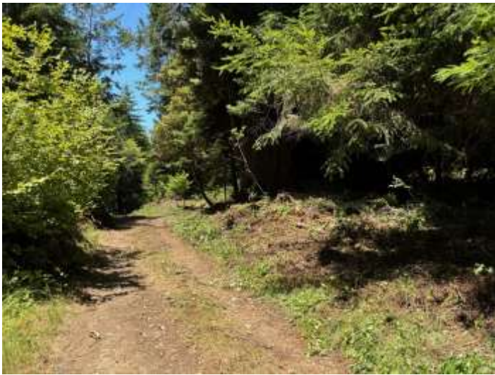
Roadside Fuel Reduction Before Clearing