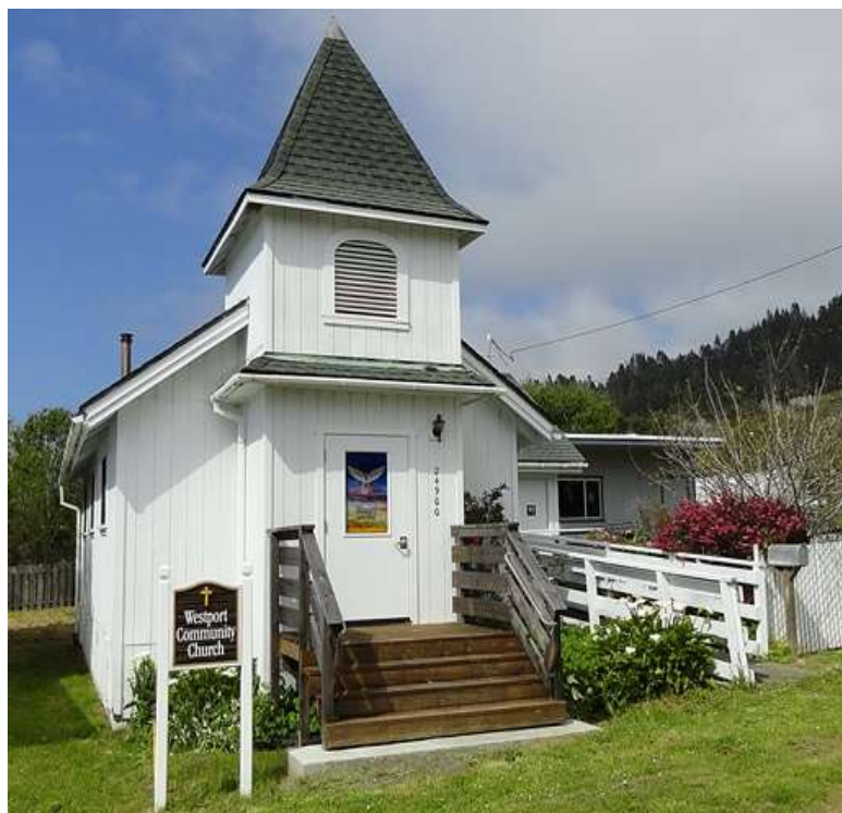
The Westport Church