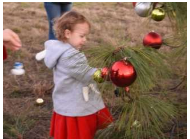
Save the Date! Saturday, December 7 th Westport Christmas Bazaar, Community Tree Lighting With Santa, and a Community Dinner!