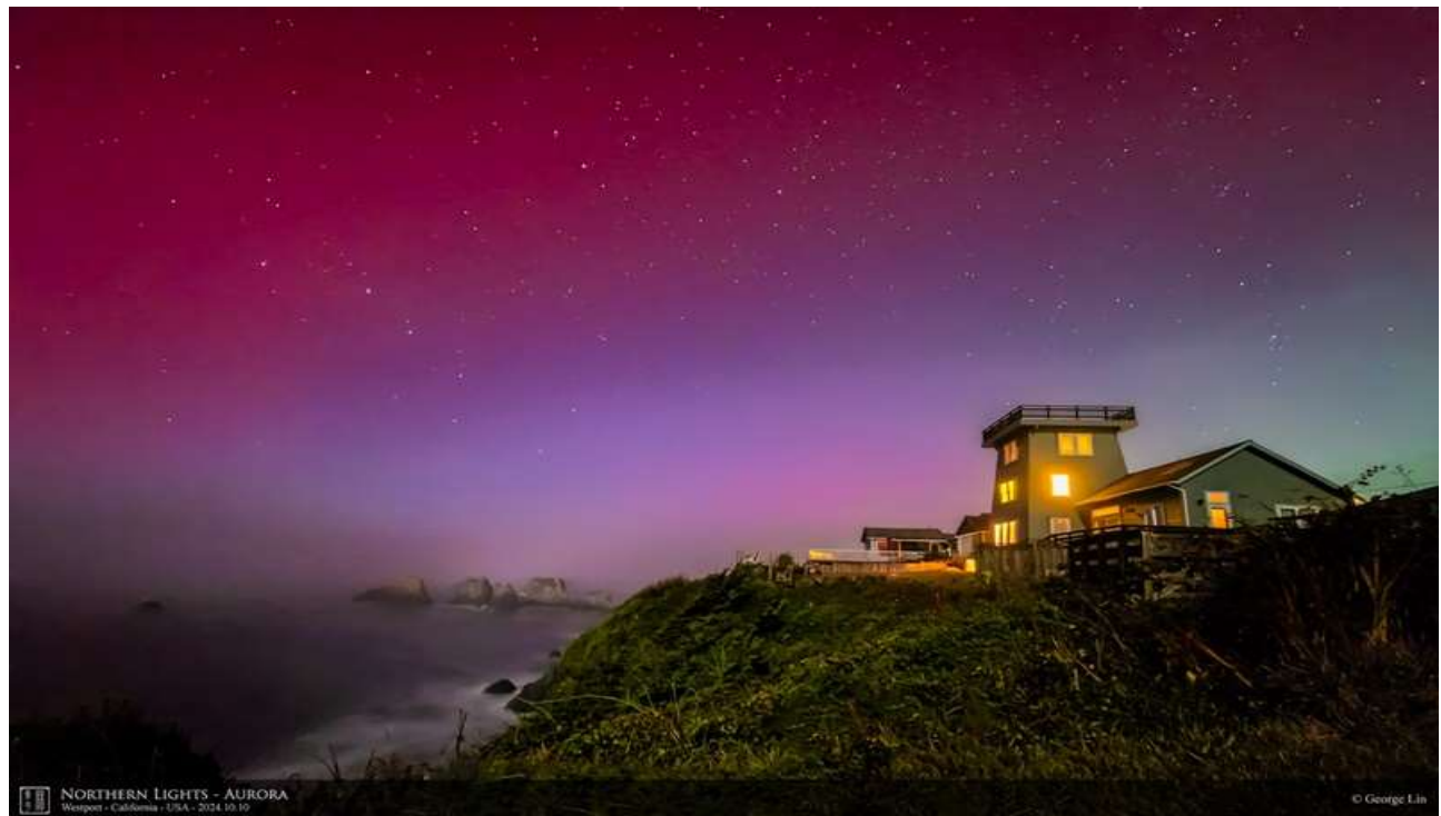
The Westport Water Tower House Illuminated by the Northern Lights, by George Lin, 10/10/24