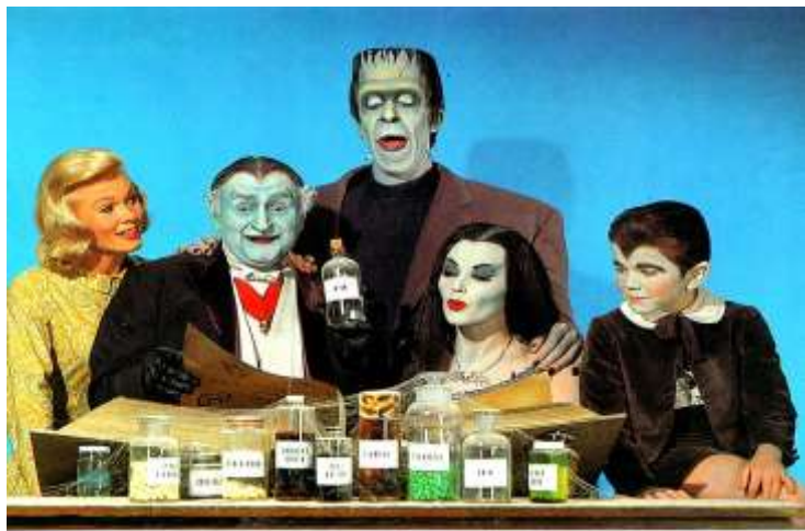
Westport Halloween October 31 st ! (see page 2)