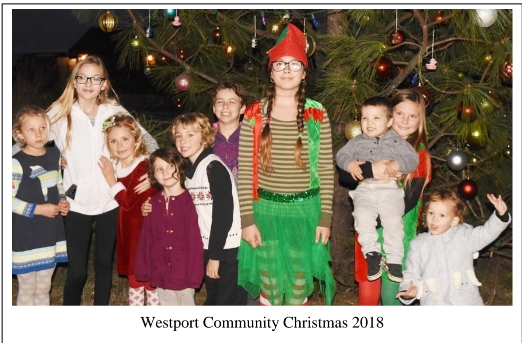
Westport Community Christmas 2018

The missing court documents from the litigation years ago and the sneaky nature of the County's Resolution challenged here reasonably cause one to be very suspicious of backdoor dealings.