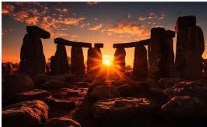
WINTER SOLSTICE DECEMBER 21 ST , 1:19AM