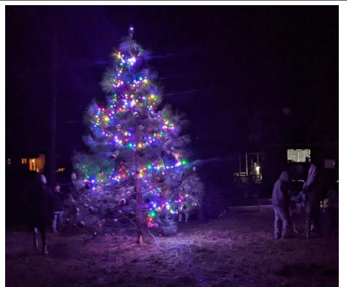
WESTPORT HOLIDAY ACTIVITIES DEC. 7 th !