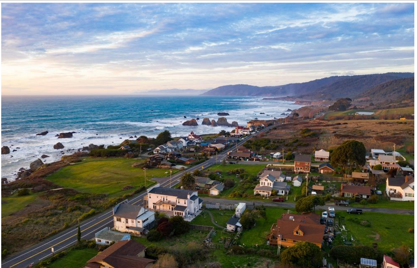
Home Sweet Home – Westport, CA, December 2021

The Westport Volunteer Fire Department is currently hosting a Food Pantry with food for all community members on the third Wednesdays and Thursdays of the month. Fresh produce, meat, dairy, cereal, canned goods, pasta, and juice are available for pick up. Bags are at the ready! Kids' bags with diapers are available as well. We are located at the Westport Firehouse, 37551 Shoreline Highway, Westport. Wednesday hours (this month December 18 th ) are 6:00PM to 8:00PM. Thursday hours (this month December 19 th ) are 10:00AM to Noon. In addition, we are considering being open on the third Saturday of the month as well. If you would like to assist in that regard, please call 707.972.3583. Thank you in advance for your support!