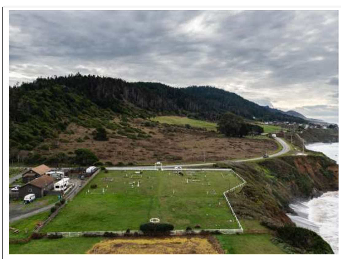
Westport from Cemetery Looking North to Town (upper right). Photo by Nelsen Brazill, December 2023.