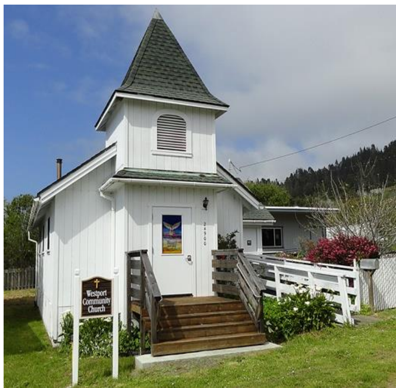
The Westport Church

“Go home to Nature, and let Nature heal you”