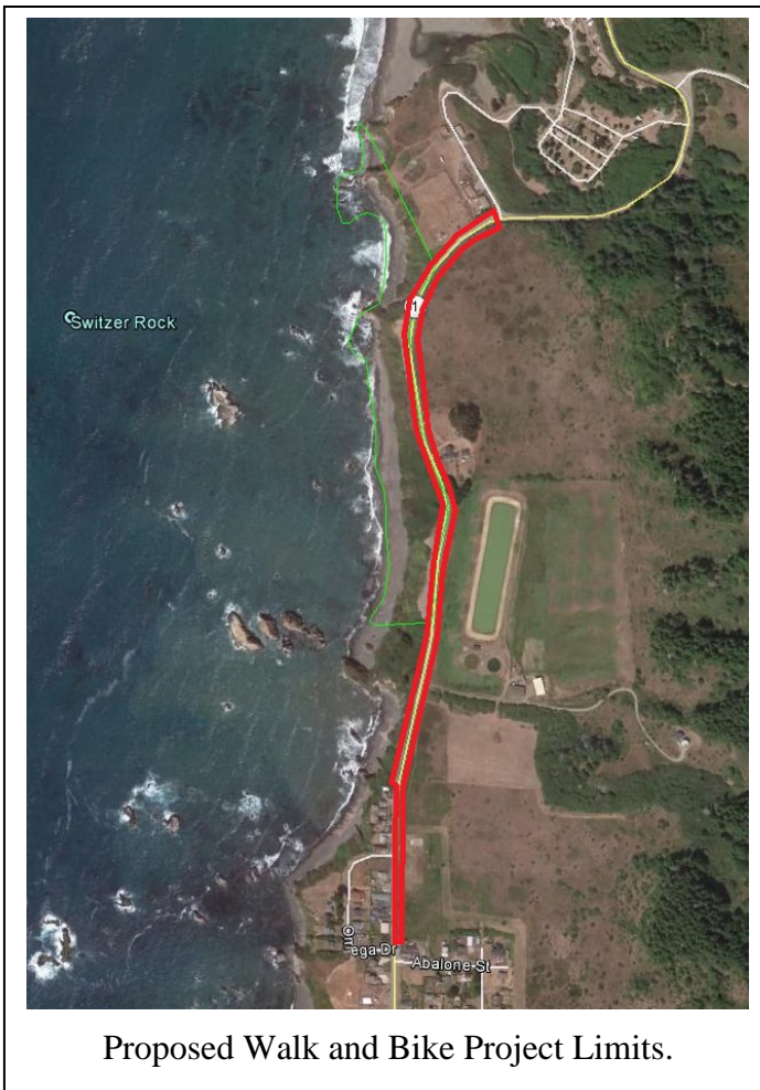
Proposed Walk and Bike Project Limits.