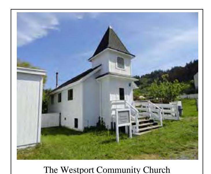
Westport Community Church