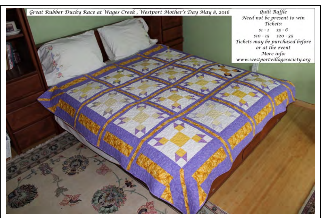
YOU could win this beautiful hand-made quilt at the Westport Mother's Day Rubber Ducky Races on May 8<sup>th</sup>! Also in the Raffle will be big blooming color bowls designed to attract hummingbirds and butterflies, plus many other prizes, so all you have to do is buy plenty of raffle tickets! Even if you only ever win stuff "once in a Blue Moon", guess what – there is a Blue Moon this month!