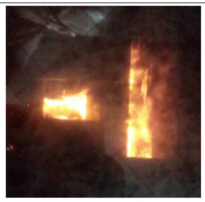
Inside the burning trailer during a flashover

The Ladders station trains Firefighters in the use ladders to access roofs and how to properly deploy