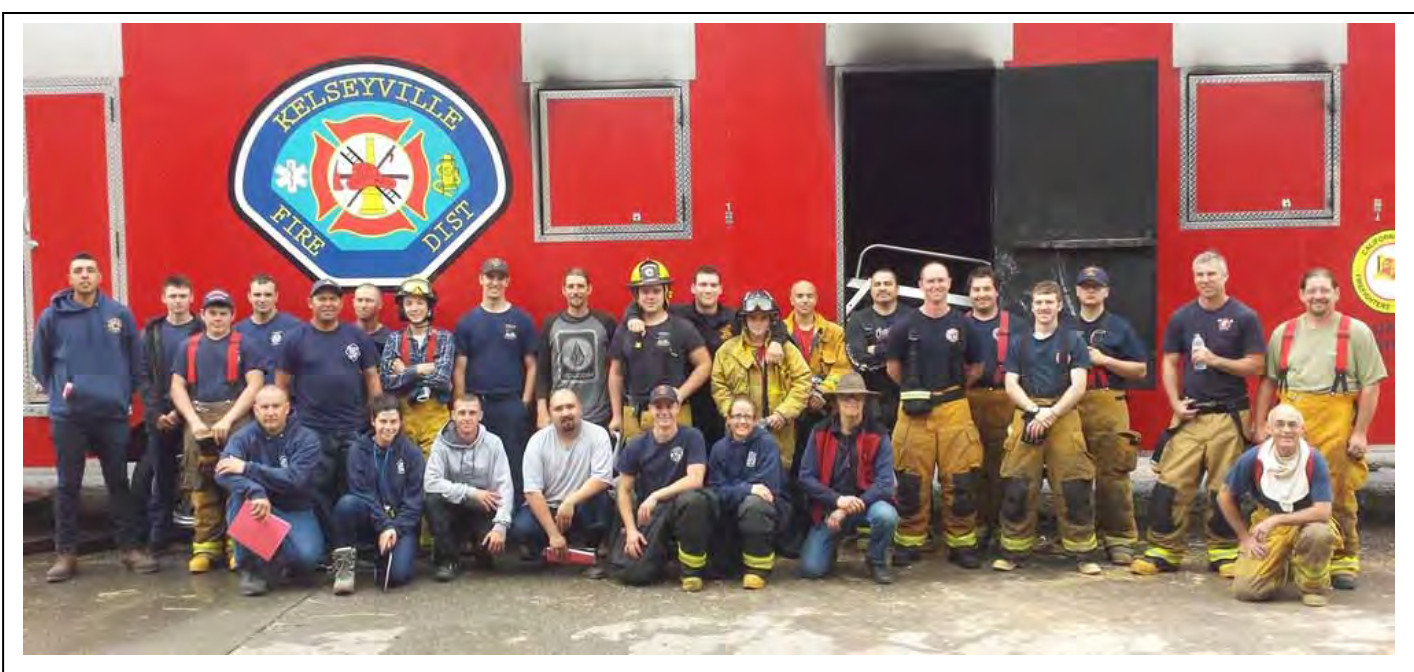
2016 Live Fire Burn Trailer Fire Academy Graduates and Participants